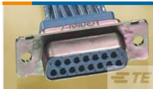
TE Part #207463-1 CRIMP SNAP RCPT ASSY,SZ 3