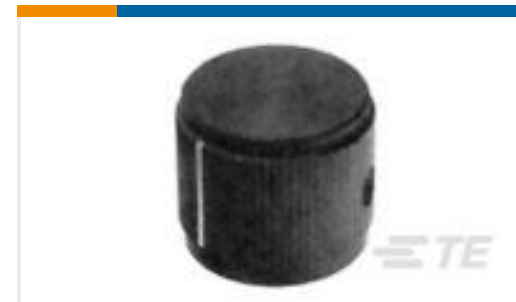
TE Part #3-1437622-0 KN1251B1/4=KNOB BLK KNURL L/HA