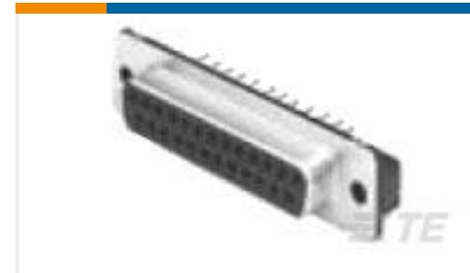
TE Part #5747299-2 15 RCPT SP/FMS STD