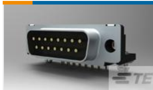
TE Part #5747841-4 15 MSFL PLUG RA 318 (IN,FM,BL)