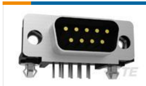
TE Part #5747840-4 HD-20 PLUG RA .318 FMS BD-LK 4