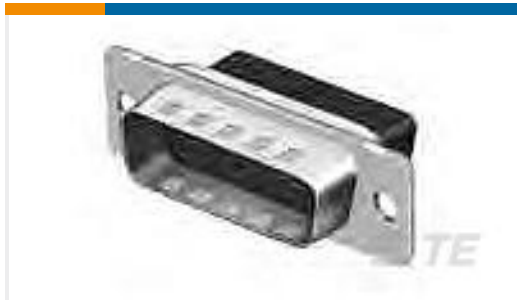
TE Part #5745036-2 PLUG ASSY,25P,HDP-20,CN