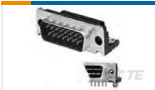
TE Part #5747843-4 37 MSFL PLUG RA 318 (IN,FM,BL)