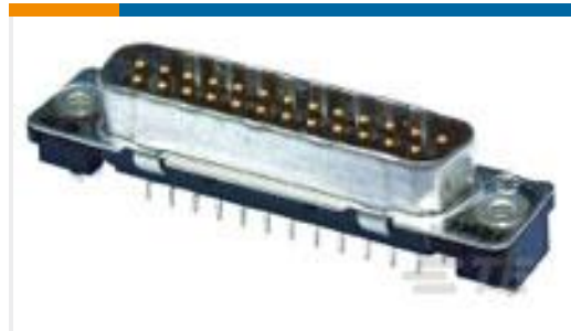
TE Part #5747872-4 15 PLUG SP/FMS STD