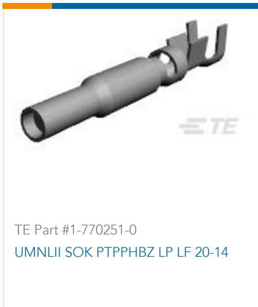
TE Part #1-770251-0 UMNLII SOK PTPPHBZ LP LF 20-14