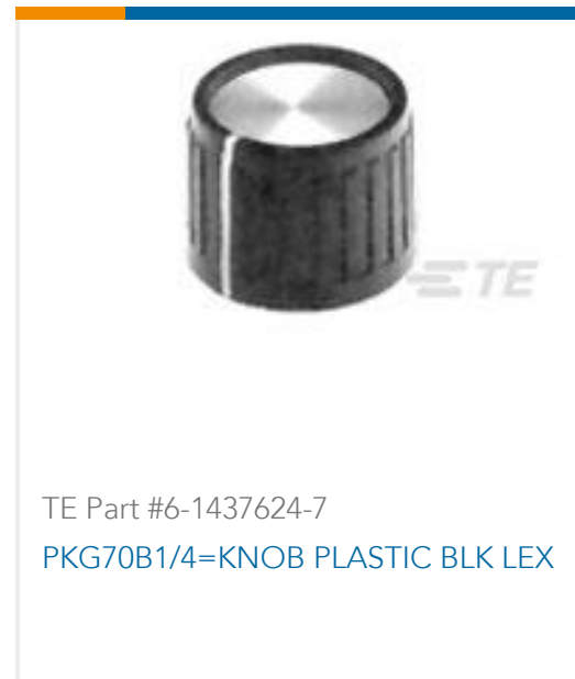
TE Part #6-1437624-7 PKG70B1/4=KNOB PLASTIC BLK LEX