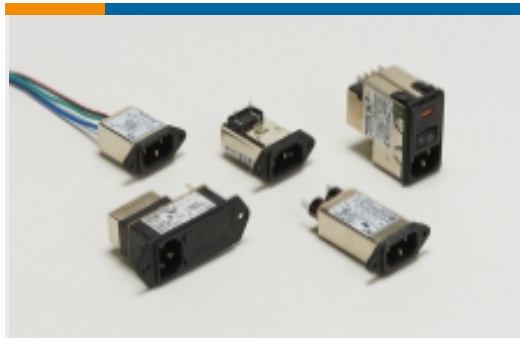
Multi-Function Inlet Filters(15)