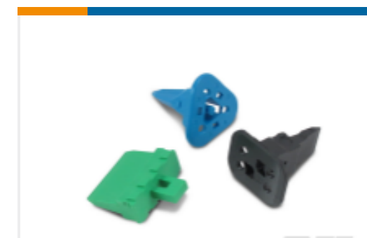
TE Part #W2S Wedgelocks: DEUTSCH DT