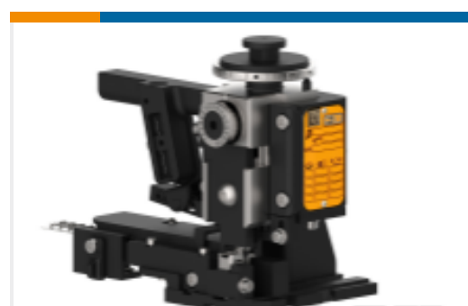
TE Part #5-2151375-1 OCEAN_2.0_APPLICATION-S-035F059F