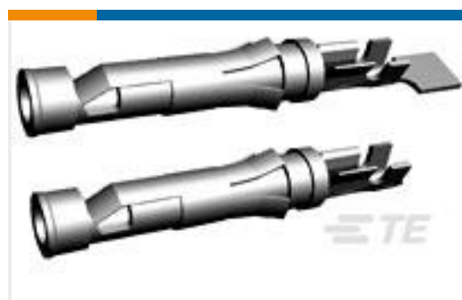
TE Part #66565-1 III+ SKT,24-20,30AU>10,LP