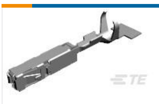
TE Part #1534160-1 AMP MCP 1.5K, CONTACT, SWS