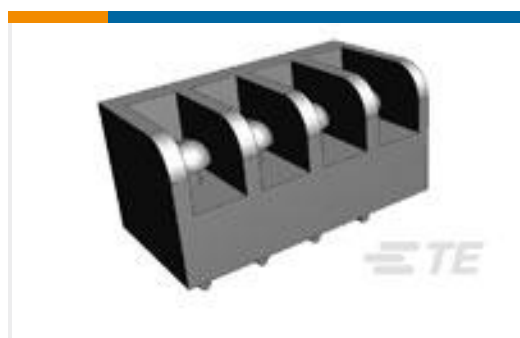
TE Part #4-1437646-2 3PCV-04-006=733004600