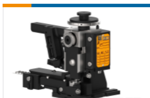
TE Part #2266592-1 OCEAN_2.0_Applicator-S-090F110F