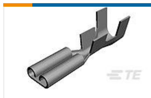
TE Part #737107-1 110 FASTON REC 20-17 AWG BR