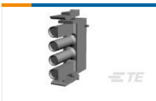
TE Part #926298-7 UNIVERSAL MATE-N-LOK 4 WAY PLUG