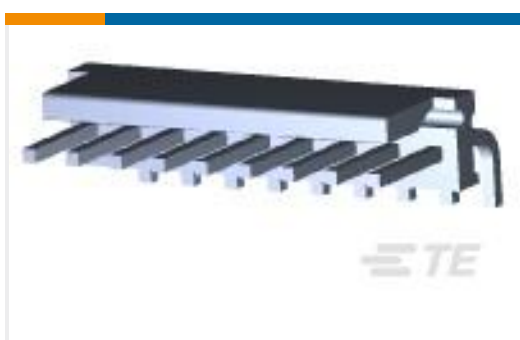
TE Part #3-641210-9 09P MTA156 HDR FLRA FB 30AU LF