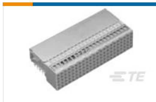
TE Part #5352152-1 Z-PACK/B22 RAF 110P