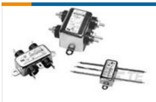
TE Part #1-6609021-2 10VB6=F7353 S0