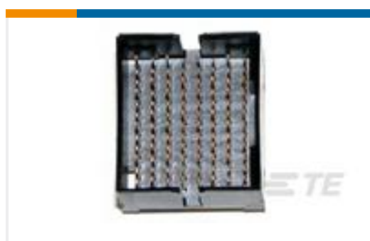
TE Part #1934271-1 Tin Man Header Assy 5x8 Double