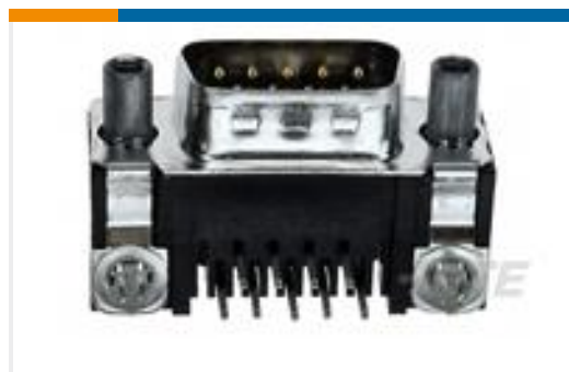
TE Part #5747842-6 25 MSFL PLUG RA 318 (SL,FM,BL)