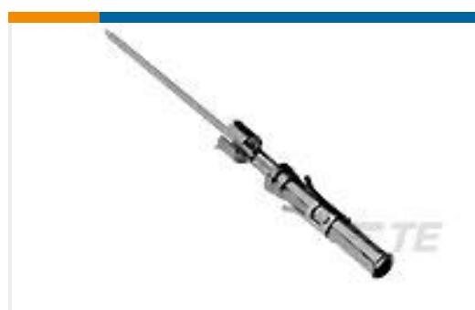
TE Part #6-66461-3 SKT,.062 DIA,.025 SQ POST,LP