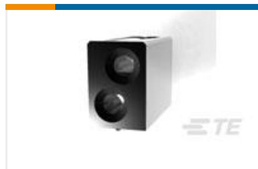
TE Part #3-1469373-7 ATCA GUIDE MODULE RA FEMALE