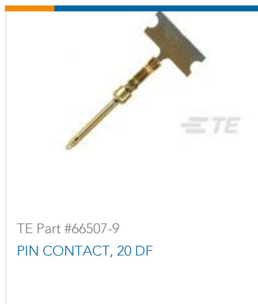
TE Part #66507-9 PIN CONTACT, 20 DF