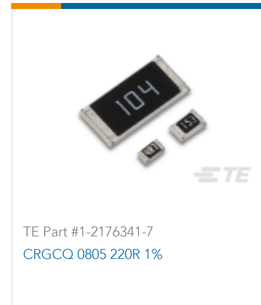
TE Part #1-2176341-7 CRGCQ 0805 220R 1%