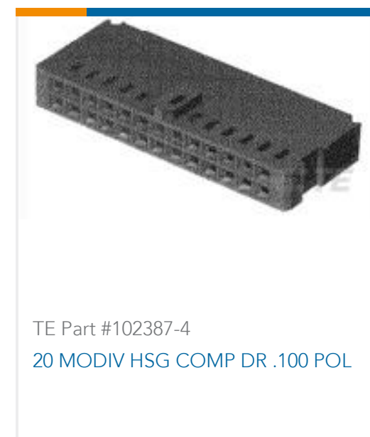
TE Part #102387-4 20 MODIV HSG COMP DR .100 POL