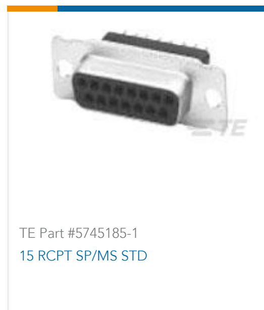
TE Part #5745185-1 15 RCPT SP/MS STD