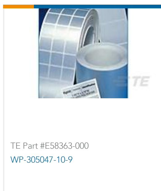
TE Part #E58363-000 WP-305047-10-9