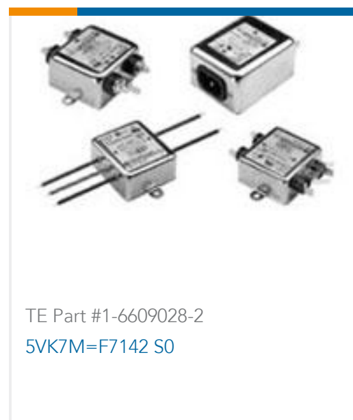
TE Part #1-6609028-2 5VK7M=F7142 S0