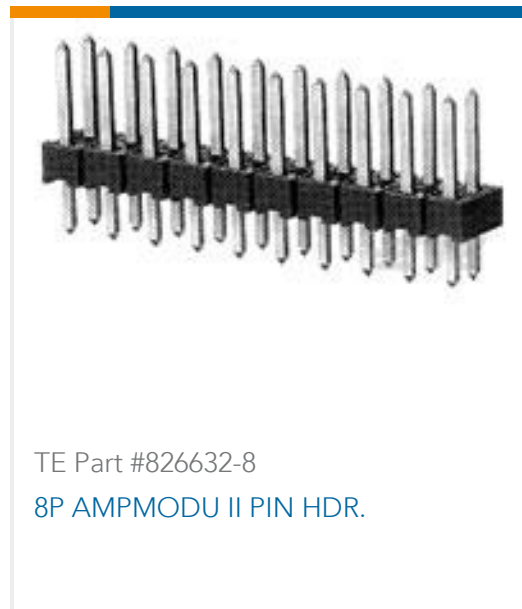
TE Part #826632-8 8P AMPMODU II PIN HDR.