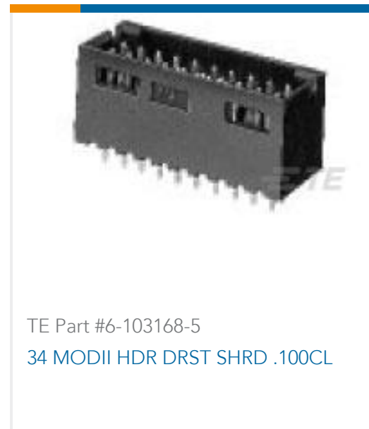
TE Part #6-103168-5 34 MODII HDR DRST SHRD .100CL