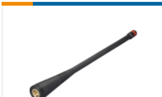
TE Part #ANT-433-CW-QW-SMA Antenna 1/4 Wave Whip 433MHz SMA