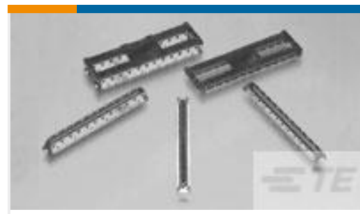
TE Part #3-1827253-6 .5FHP05H,220,S,GIG,08/Sn,HT,NSYes