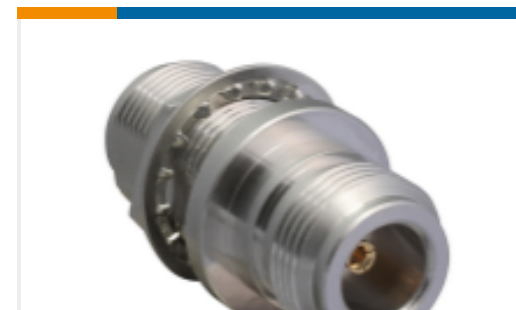
TE Part #ADP-NF-NF-B-W N Type Jack to N Type Jack Bulkhead