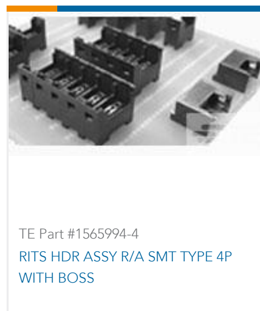
TE Part #1565994-4 RITS HDR ASSY R/A SMT TYPE 4P WITH BOSS