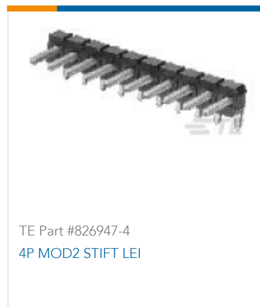
TE Part #826947-4 4P MOD2 STIFT LEI