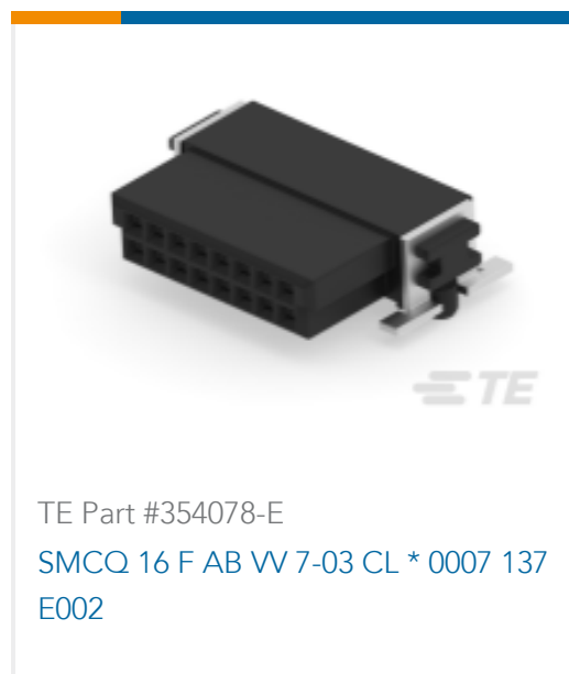
TE Part #354078-E SMCQ 16 F AB VV 7-03 CL * 0007 137 E002