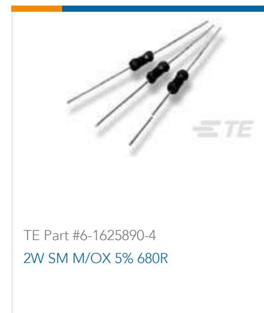
TE Part #6-1625890-4 2W SM M/OX 5% 680R