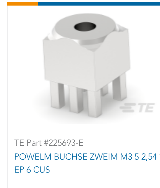
TE Part #225693-E POWELM BUCHSE ZWEIM M3 5 2,54 * EP 6 CUS