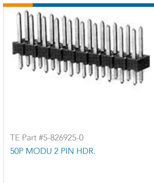
TE Part #5-826925-0 50P MODU 2 PIN HDR.