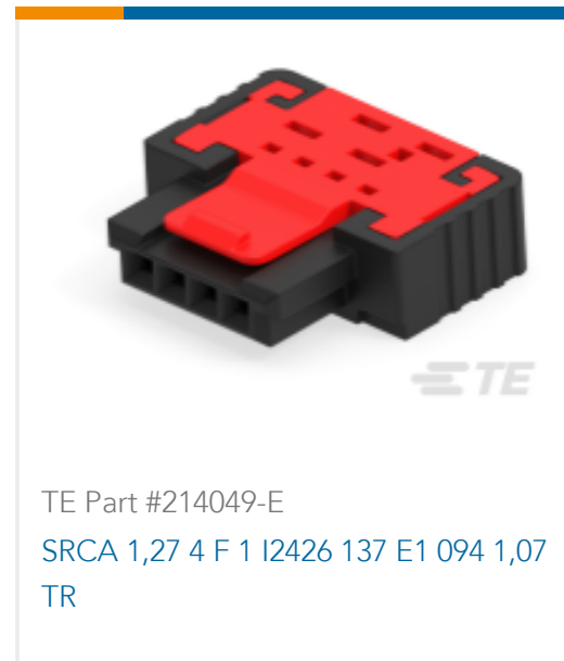
TE Part #214049-E SRCA 1,27 4 F 1 I2426 137 E1 094 1,07 TR