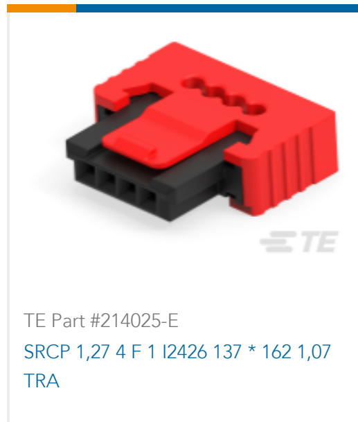
TE Part #214025-E SRCP 1,27 4 F 1 I2426 137 * 162 1,07 TRA