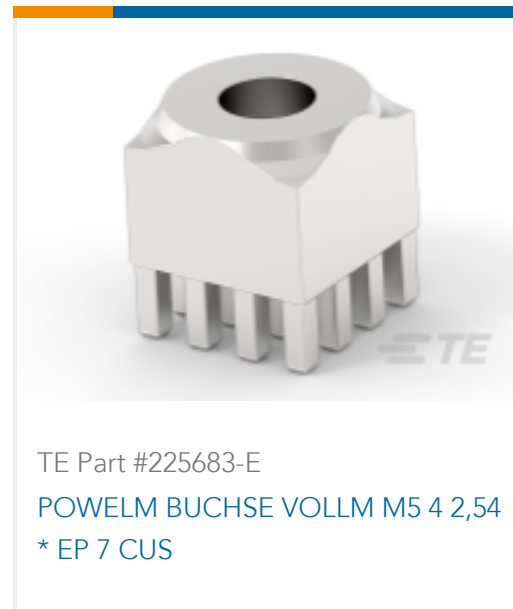
TE Part #225683-E POWELM BUCHSE VOLLM M5 4 2,54 * EP 7 CUS