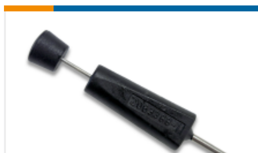
TE Part #2063388-1 TOOL, EXTRACTION