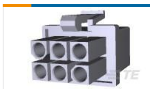
TE Part #794895-1 6 CIR MINI UMNL RND WIRE HOLES