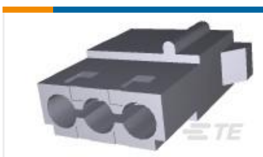
TE Part #1-480303-0 03P CMNL PLUG HSG F/H NATL