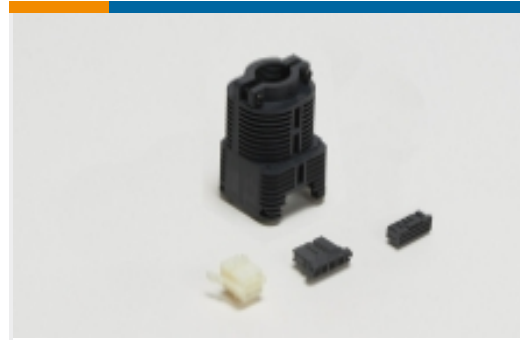
Rectangular Connector Housings(11)