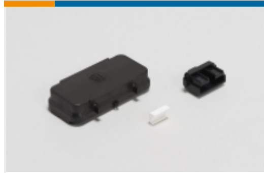
Rectangular Caps & Covers(2)