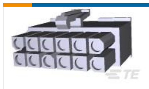
TE Part #770581-1 12P MINI UMNL PLUG HSG