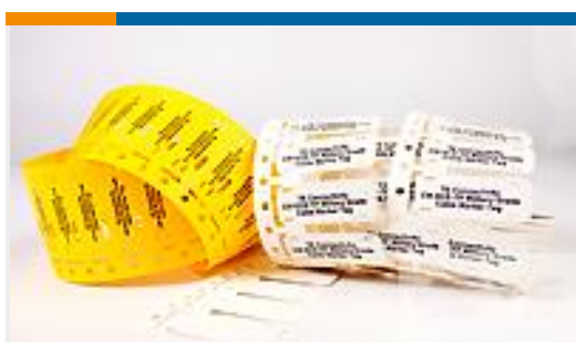
TE Part #E17344-000 CM-SCE-TP-1/2-4H-9