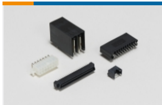
Standard Rectangular Connectors(7)