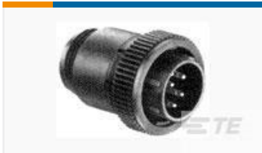
TE Part #211400-1 CPC PLUG ASSEMBLY SIZE 13-7