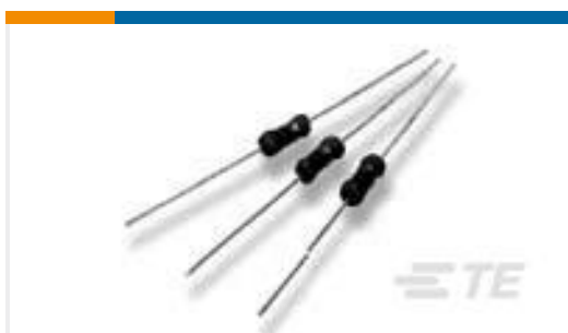
TE Part #1879072-7 3W SM M/OX 2% 390R