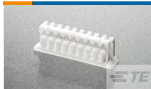
TE Part #1-440146-0 1.25mm WTB Socket,Housing,10p