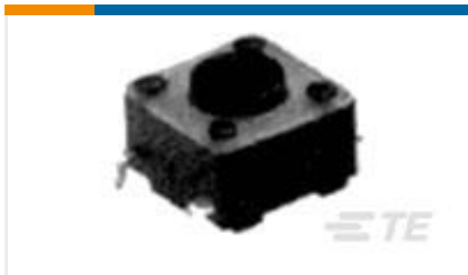
TE Part #2-1437565-8 FSM2JSMMAA=TACTILE 260G FORCE S