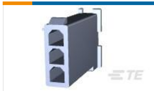
TE Part #172234-1 3P MINI UNIVERSAL MATE-N-LOK CAP HOUSING