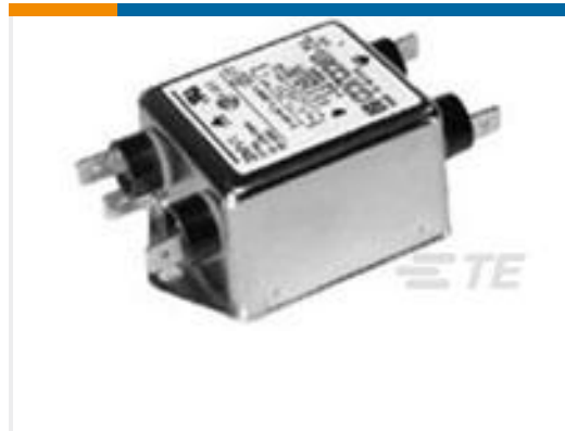
TE Part #6609056-4 20MV1=F7759 S0