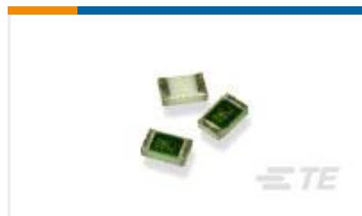
TE Part #2-1879337-7 CPF 0603 4K64 1% 50PPM 1K RL