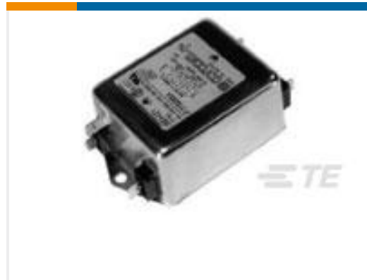
TE Part #3-1609037-3 30EHZ6=F8358