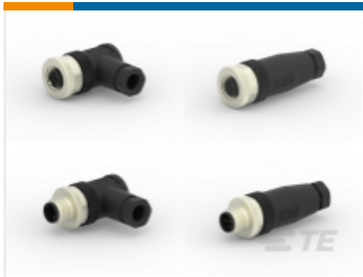
TE Part #T4112001081-000 M12 Field Installable Unshielded