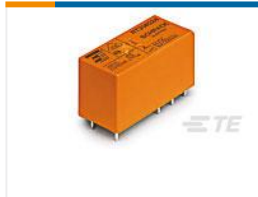
TE Part #1393240-4 RT314524