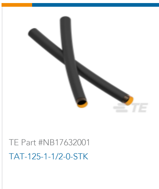
TE Part #NB17632001 TAT-125-1-1/2-0-STK