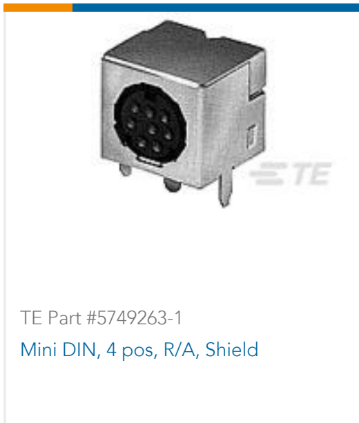
TE Part #5749263-1 Mini DIN, 4 pos, R/A, Shield