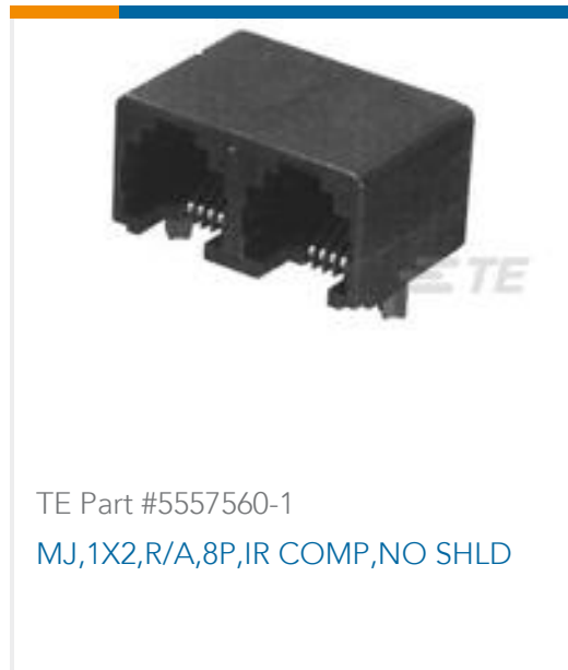
TE Part #5557560-1 MJ,1X2,R/A,8P,IR COMP,NO SHLD