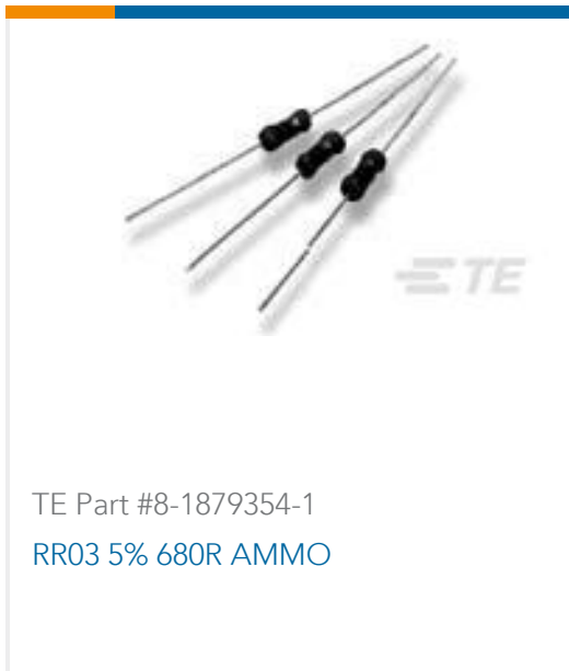
TE Part #8-1879354-1 RR03 5% 680R AMMO