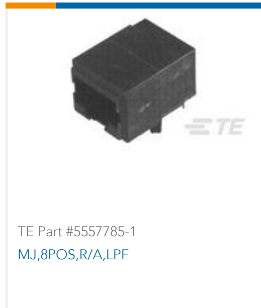
TE Part #5557785-1 MJ,8POS,R/A,LPF