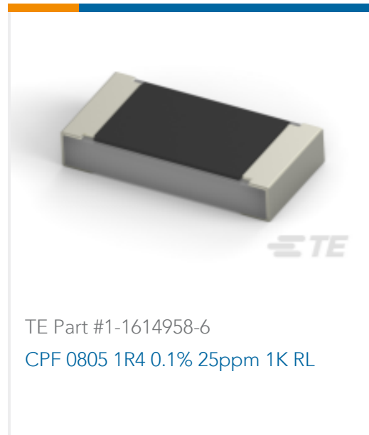
TE Part #1-1614958-6 CPF 0805 1R4 0.1% 25ppm 1K RL