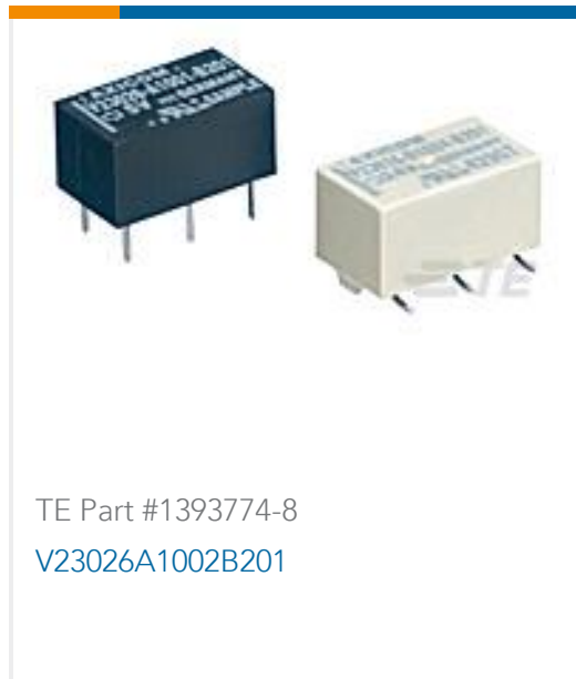
TE Part #1393774-8 V23026A1002B201