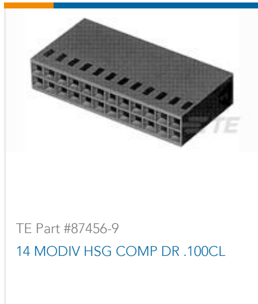
TE Part #87456-9 14 MODIV HSG COMP DR .100CL