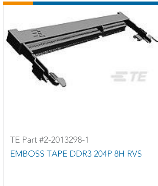
TE Part #2-2013298-1 EMBOSS TAPE DDR3 204P 8H RVS