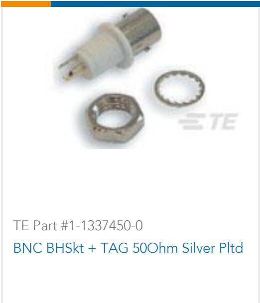
TE Part #1-1337450-0 BNC BHSkt + TAG 50Ohm Silver Pltd