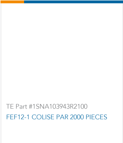
TE Part #1SNA103943R2100 FEF12-1 COLISE PAR 2000 PIECES