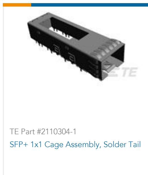
TE Part #2110304-1 SFP+ 1x1 Cage Assembly, Solder Tail