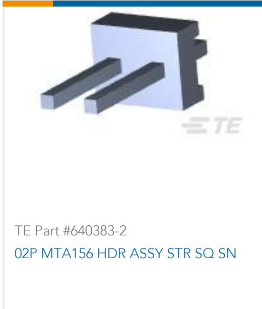
TE Part #640383-2 02P MTA156 HDR ASSY STR SQ SN