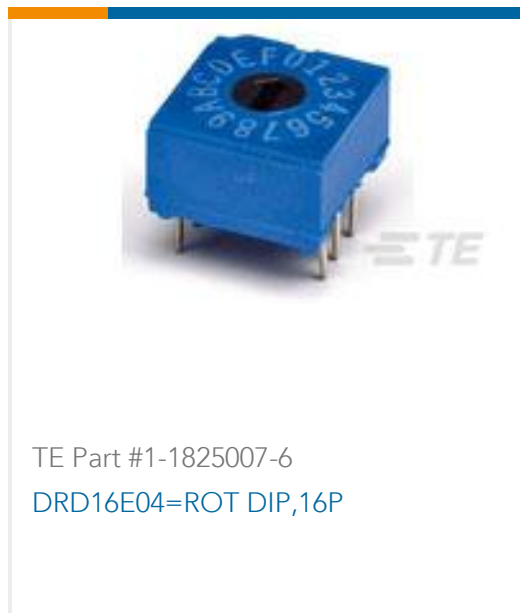
TE Part #1-1825007-6 DRD16E04=ROT DIP,16P