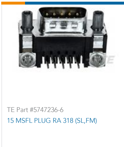
TE Part #5747236-6 15 MSFL PLUG RA 318 (SL,FM)