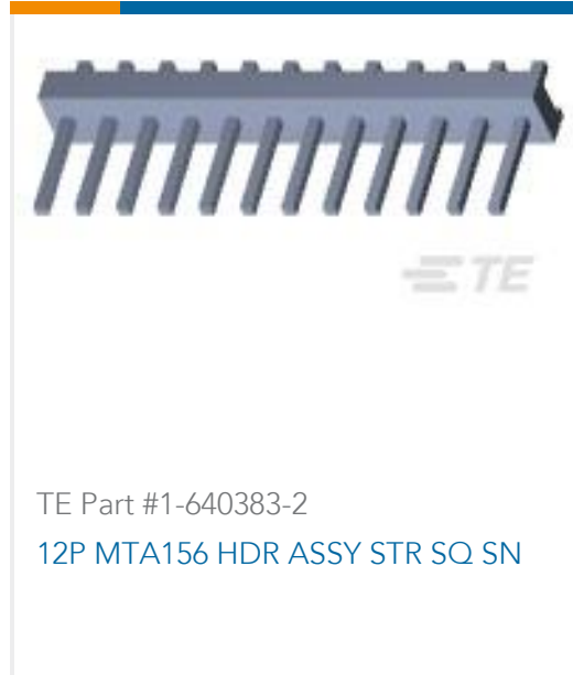
TE Part #1-640383-2 12P MTA156 HDR ASSY STR SQ SN