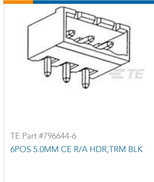
TE Part #796644-6 6POS 5.0MM CE R/A HDR,TRM BLK