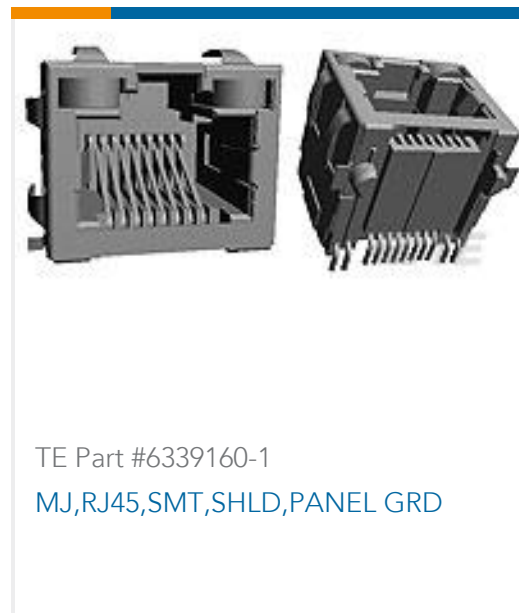
TE Part #6339160-1 MJ,RJ45,SMT,SHLD,PANEL GRD