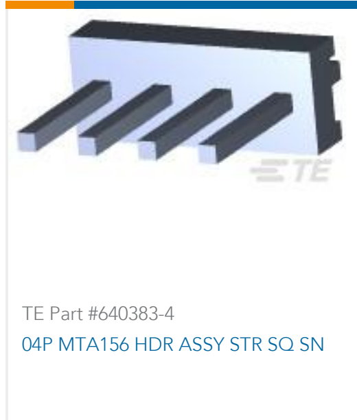
TE Part #640383-4 04P MTA156 HDR ASSY STR SQ SN