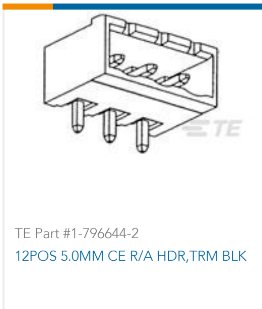
TE Part #1-796644-2 12POS 5.0MM CE R/A HDR,TRM BLK