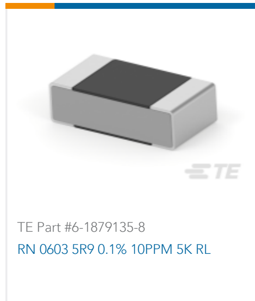
TE Part #6-1879135-8 RN 0603 5R9 0.1% 10PPM 5K RL