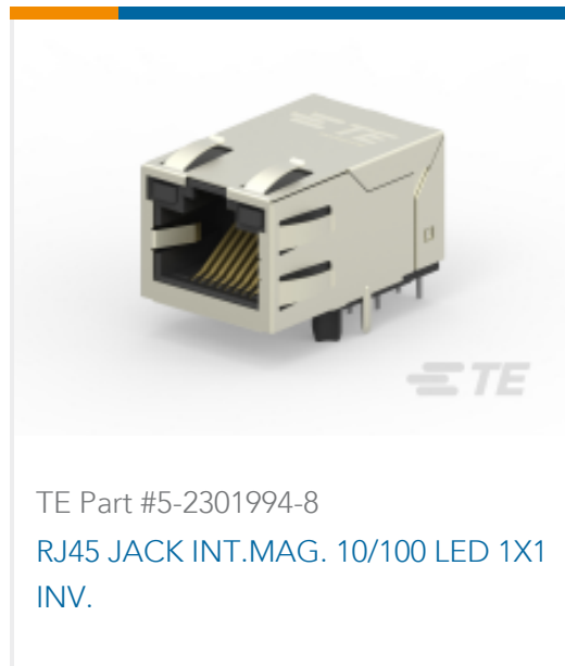
TE Part #5-2301994-8 RJ45 JACK INT.MAG. 10/100 LED 1X1 INV.