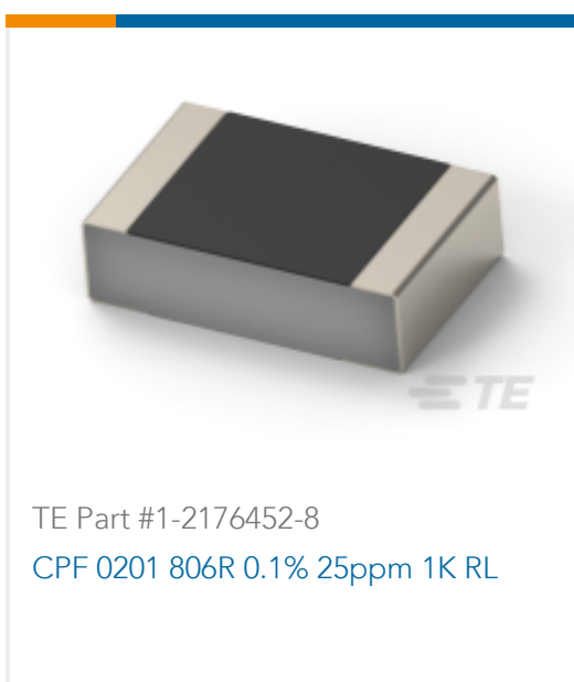
TE Part #1-2176452-8 CPF 0201 806R 0.1% 25ppm 1K RL