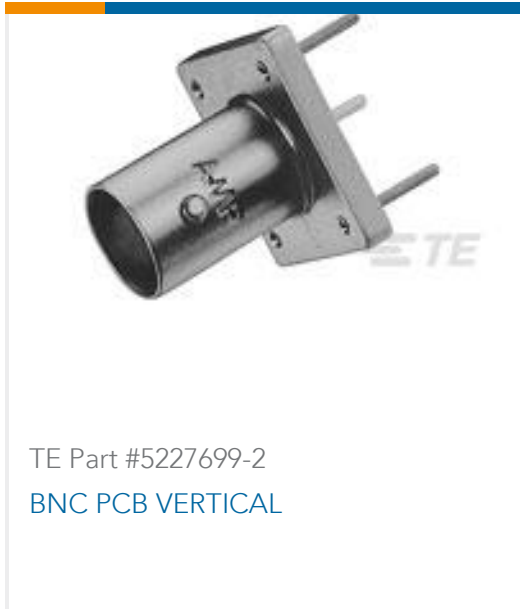
TE Part #5227699-2 BNC PCB VERTICAL