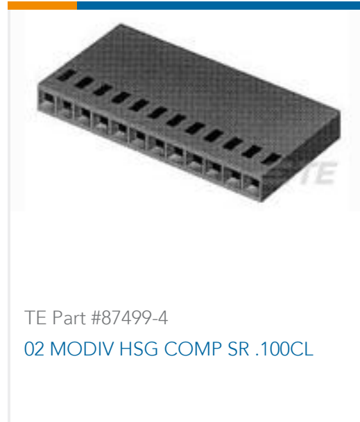
TE Part #87499-4 02 MODIV HSG COMP SR .100CL