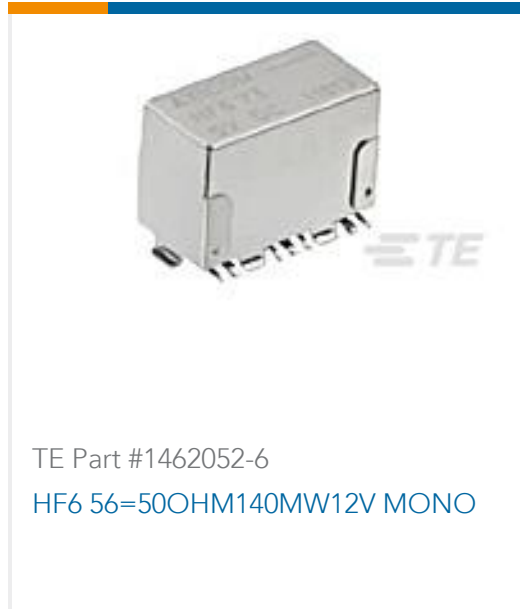
TE Part #1462052-6 HF6 56=50OHM140MW12V MONO