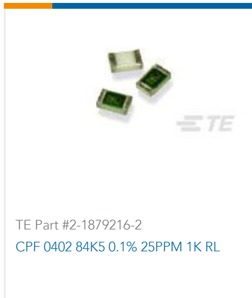
TE Part #2-1879216-2 CPF 0402 84K5 0.1% 25PPM 1K RL