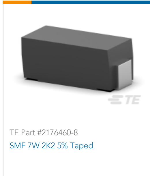
TE Part #2176460-8 SMF 7W 2K2 5% Taped