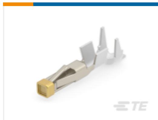
TE Part # 2-2834067-3 SOCKET CONTACT, MINIATURE WATERPROOF CONN