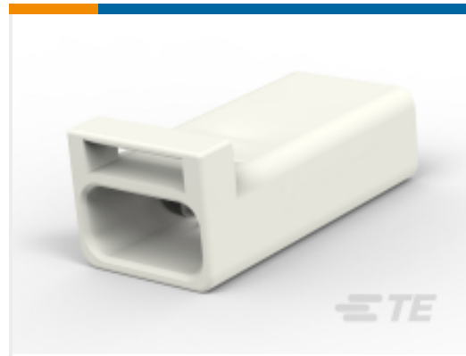
TE Part # 1-2834075-3 3P REC, MINIATURE WATERPROOF CONN. WHITE