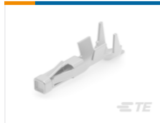
TE Part # 1-2834067-2 SOCKET CONTACT, MINIATURE WATERPROOF CONN