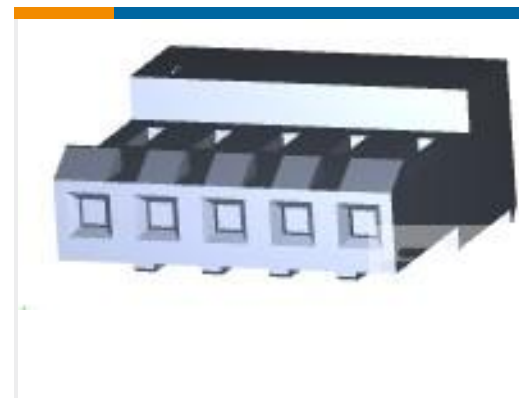
TE Part #3-640428-5 05P MTA156 CONN ASSY 22AWG RED