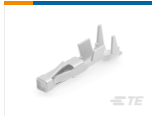
TE Part # 2-2834067-2 SOCKET CONTACT, MINIATURE WATERPROOF CONN