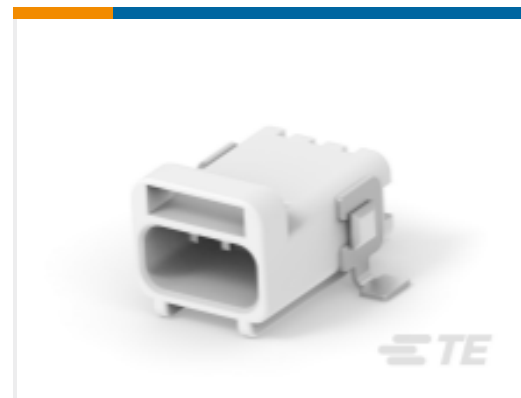
TE Part #1-2834236-1 3P REC, IP67 R/A SMT CONN, NATURE