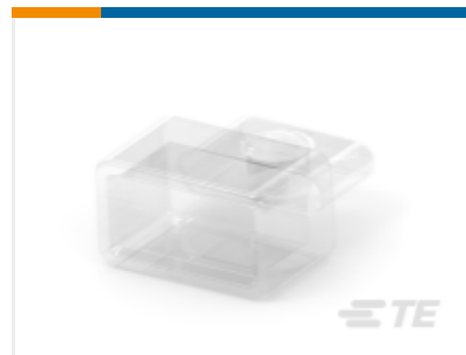
TE Part # 2834268-1 PROTECTION COVER, MINIATURE CONN, PLUG