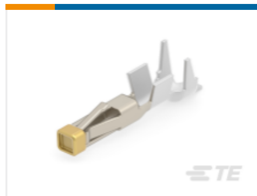
TE Part # 1-2834067-3 SOCKET CONTACT, MINIATURE WATERPROOF CONN