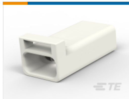
TE Part #1-2834075-2 2P REC, MINIATURE WATERPROOF CONN. WHITE