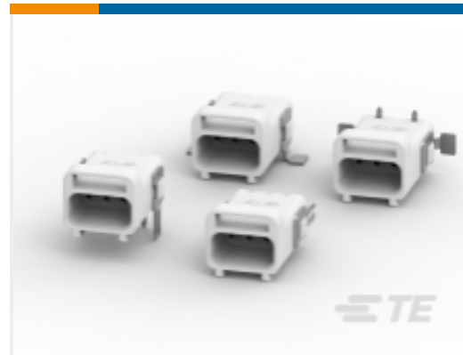
TE Part # CAT-SL36-M6642B Miniature Headers, SlimSeal