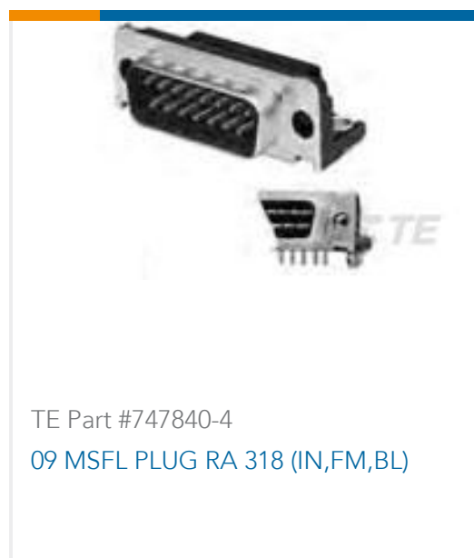
TE Part #747840-4 09 MSFL PLUG RA 318 (IN,FM,BL)