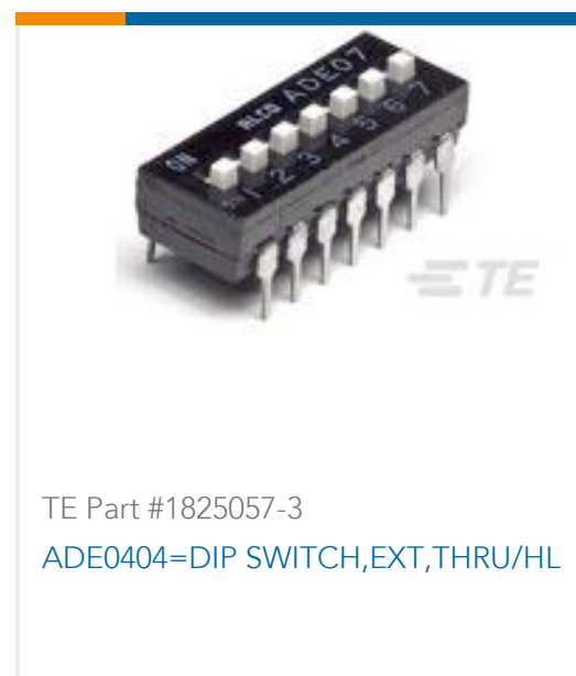
TE Part #1825057-3 ADE0404=DIP SWITCH,EXT,THRU/HL