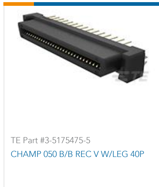
TE Part #3-5175475-5 CHAMP 050 B/B REC V W/LEG 40P