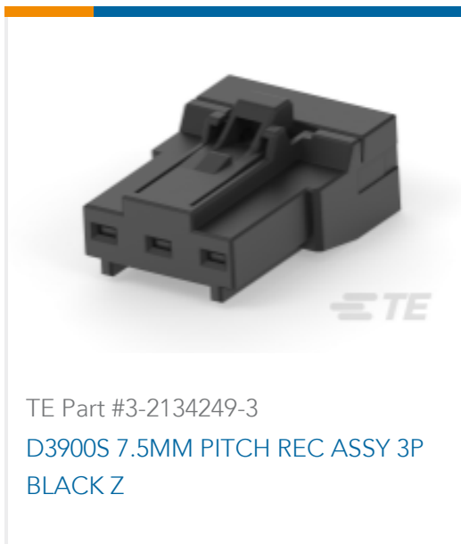
TE Part #3-2134249-3 D3900S 7.5MM PITCH REC ASSY 3P BLACK Z