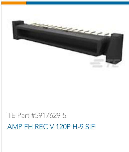
TE Part #5917629-5 AMP FH REC V 120P H-9 SIF