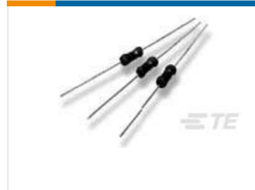
TE Part #1879350-5 RR01 5% R33 AMMO