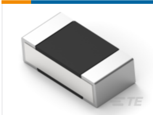
TE Part #5-2176305-2 RP 1E 0.1W 365R 0.1% 25PPM 5K RL