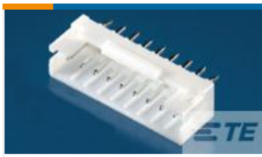
TE Part #1735446-7 2MM PITCH HPI POST HEADER, VERTICAL, 7P