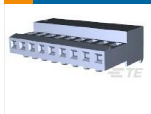
TE Part #3-640443-9 09P MTA100 CONN ASSY GRN