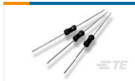
TE Part #3-1879355-4 RR03 5% 100K AMMO