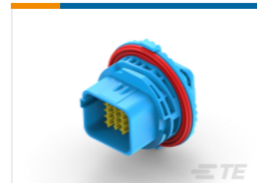
TE Part #2-2350891-4 20POS, HYBRID, PIN HSG ASSY, SLD, COD D