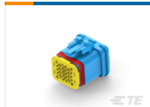
TE Part #1-2350890-4 20POS, HYBRID, SOC HSG ASSY, SLD, COD D