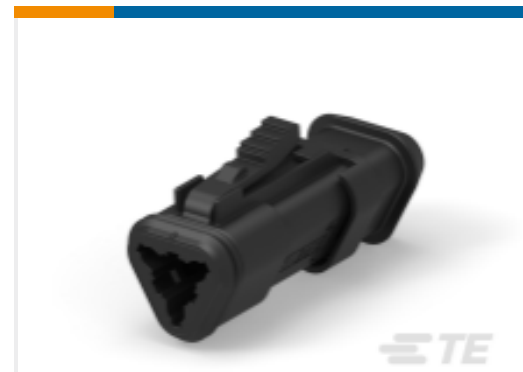
TE Part #2-2600027-8 3CCT BLACK PLUG W/LARGE SEAL & HS