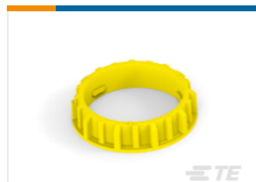
TE Part #2350943-1 FIX RING, CONN KIT