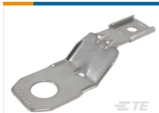
TE Part #1027-003-1200 CLIP, SS, 11MM HOLE, ST