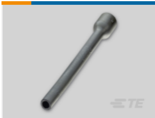
TE Part #922143-000 202F211-51/86-0