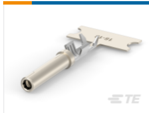
TE Part #3-2600021-3 XRC SOCKET 14-18 AWG Ni Plated