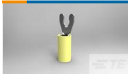
TE Part #52942 TERMINAL,PIDG SPR SPD 12-10 8