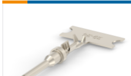
TE Part #3-2600020-2 XRC PIN TERMINAL 14-18AWG Ni Plated