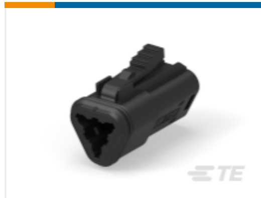
TE Part #2600027-1 3CCT BLACK PLUG W/SMALL SEAL