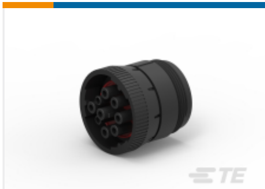
TE Part #HD16-9-1939SE PLUG ASM