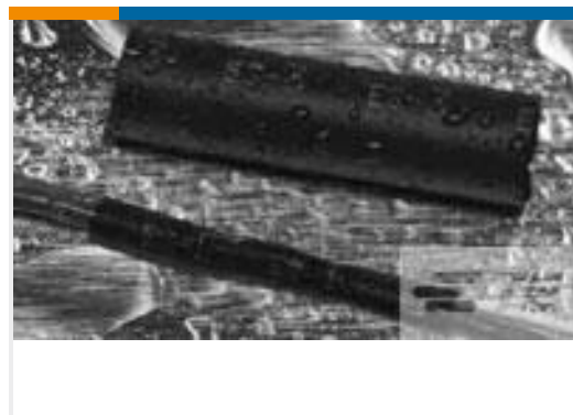
TE Part #121397P024 ES2000-NO.3-B8-0-STK