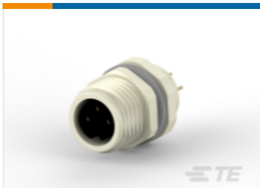
TE Part #T4041017031-000 M8.FMLE.PNLREAR.3POS.STR PCB