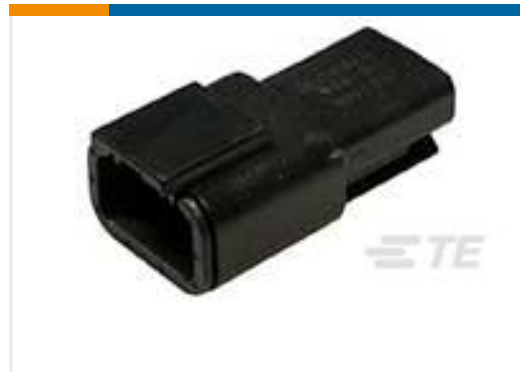
TE Part #DTM04-3P-E004 REC, 3P, BLK, N