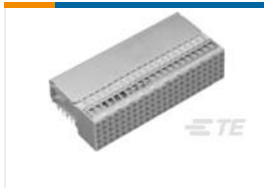
TE Part #5352152-1 Z-PACK/B22 RAF 110P