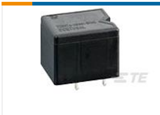
TE Part #1393277-4 V23076A1001C133