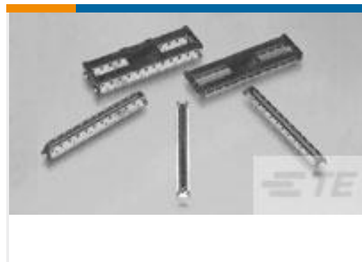
TE Part #3-6318490-6 .5FHR04H,220,S,GIG,08/Sn,HT,NSYes