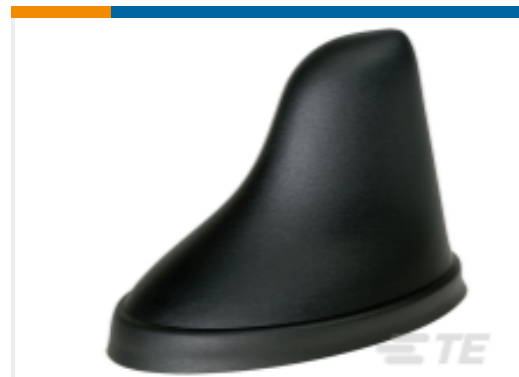
TE Part #955-181-005 CGNW 702659 SF S/FAKRA/D/C/E/5.0