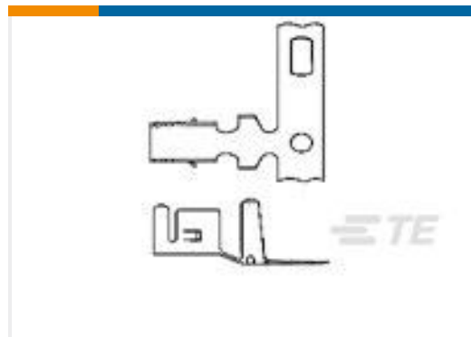
TE Part #3-770060-1 MINI AMP-IN PTLP/PHBZ