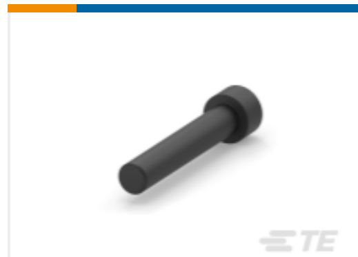
TE Part #2600048-1 BLIND CAVITY PLUG