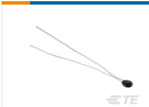
TE Part #GA10K4A1A DISCRETE 10K OHMS,+/-0.1C FROM 0C TO 70C