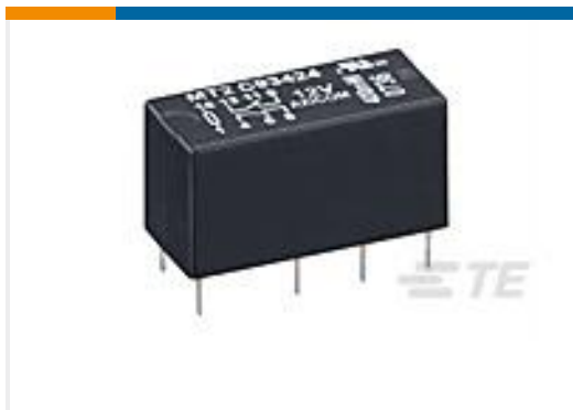
TE Part #6-1462000-2 C93432=MT Relay 550 mW 12 V