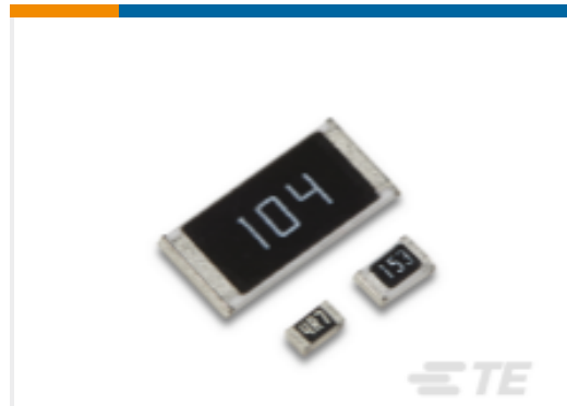
TE Part #5-2176339-1 CRGCCO 0603 150K 1%