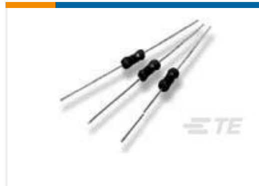
TE Part #2-1625892-8 3W SM M/OX 5% 20K