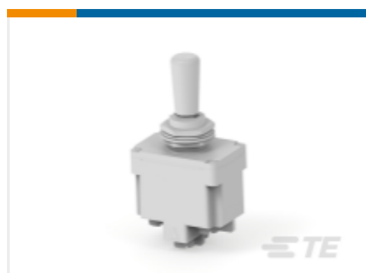
TE Part #K1002930 Toggle Switch 08-2-1-22