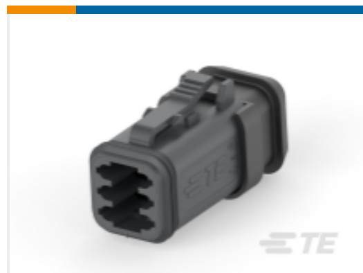
TE Part #1-2600035-9 6CCT BLACK PLUG W/SMALL SEAL & HS