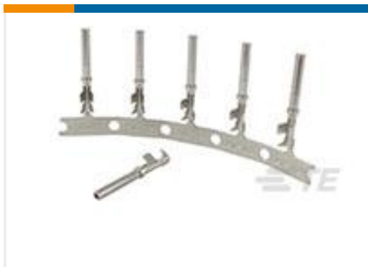
TE Part #1062-20-0222 SOC, SF, SIZE 20, 16-22, NI/NI