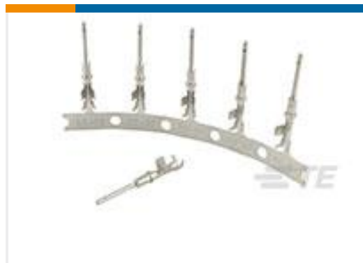
TE Part #1060-20-0222 PIN, SF, SIZE 20, 16-22, NI/NI