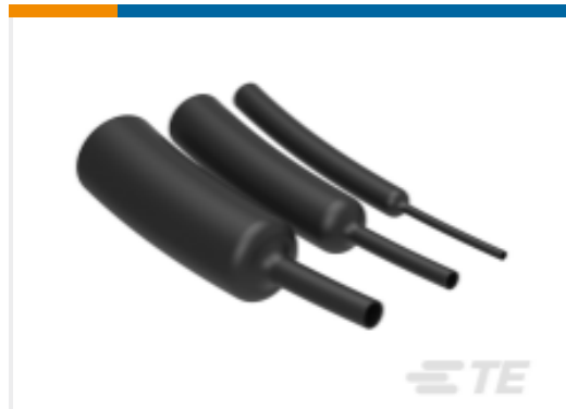
TE Part #5677954003 RNF3000 Heat shrink Tubing