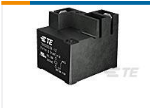
TE Part #1-1393210-3 T9AS1D12-12