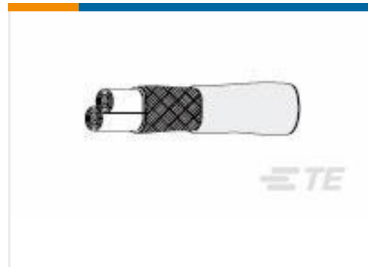
TE Part #3822293013 44A1121-20-0/9-9