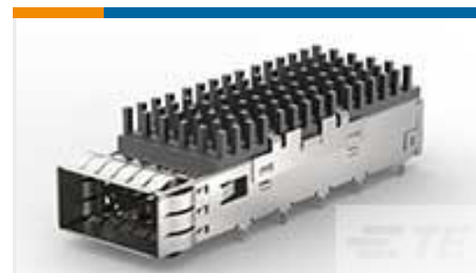
TE Part #2170704-2 CAGE ASSY, QSFP28 1X1, SPRING, HS