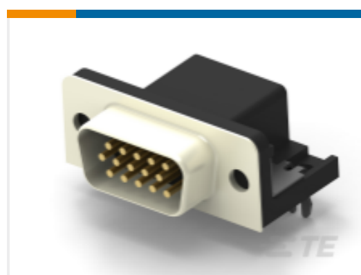
TE Part #2311774-1 AMPL PLUG, HD22, R/A, 15P, THREADED