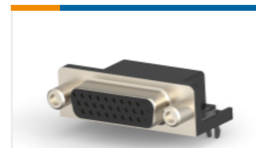
TE Part #2311768-1 AMPL REC, HD22, R/A, 26P, THREADED