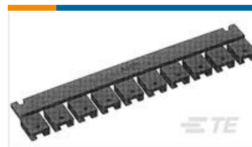
TE Part #531230-4 SHUNT, .200 C/L, 2 POS, SN