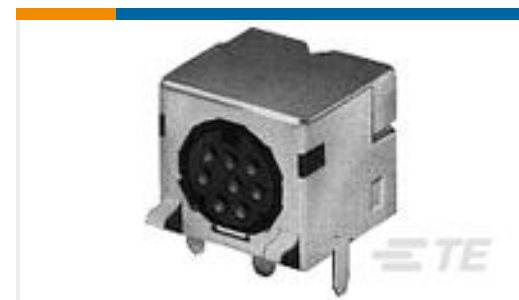
TE Part #5750069-1 Mini DIN, 4 pos, R/A, Shield