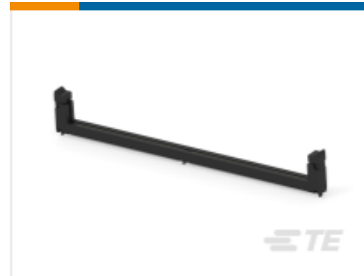
TE Part # 1-2355626-1 DDR5 DIMM BLACK HSG AND BLACK LATCH