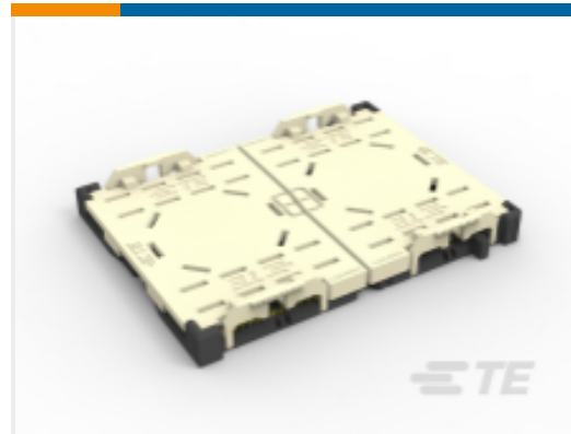
TE Part # 1-2332283-3 LGA4189-5 SOCKET P5 KIT FOR ODM (30U AU)