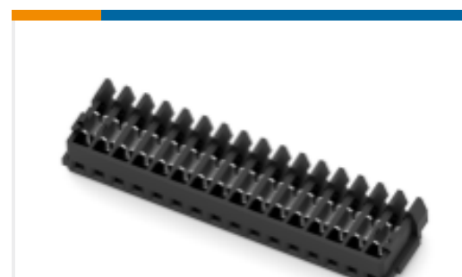
TE Part #3-353293-6 1.5MM CT MT REC ASSY 16P BLACK