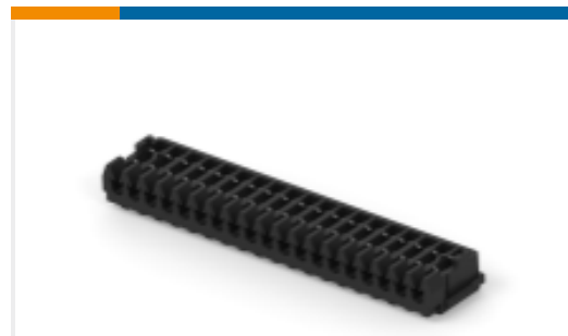
TE Part #3-353293-9 1.5MM CT MT REC ASSY 19P BLACK