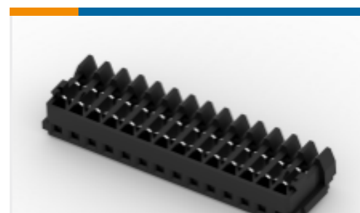
TE Part #3-353293-4 1.5MM CT MT REC ASSY 14P BLACK