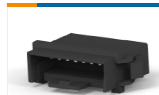
TE Part #2-292215-8 MINI CT SGL RELAY 8P BLACK