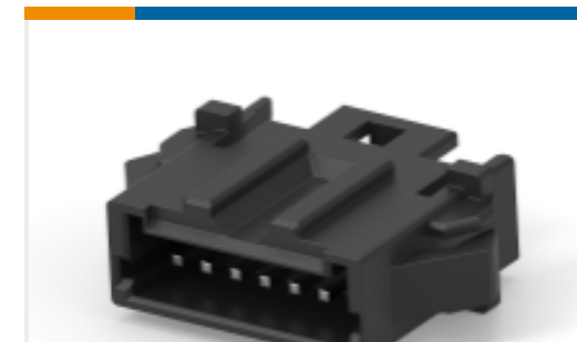
TE Part #2-292215-7 MINI CT SGL RELAY 7P BLACK