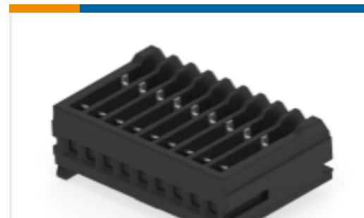
TE Part #2355088-9 MICRO CT CONN MT REC ASSEMBLY 9P