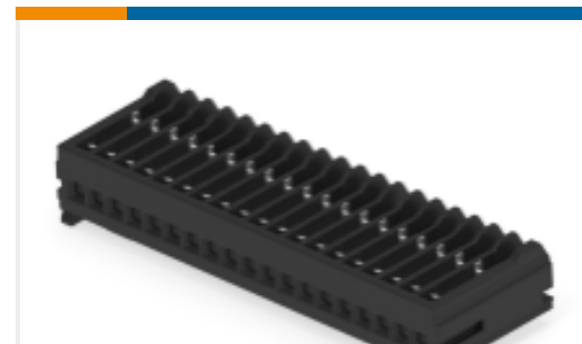
TE Part #1-2355088-9 MICRO CT CONN MT REC ASSEMBLY 19P