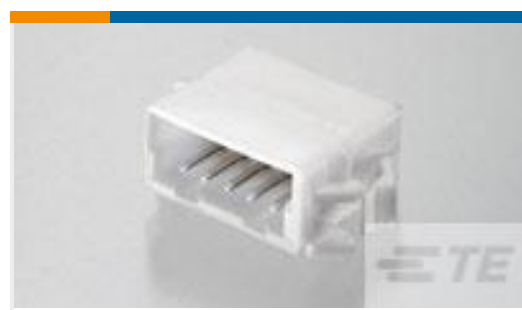
TE Part #6-292254-2 CT RELAY HDR ASSY 2P BLACK