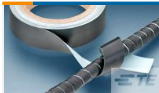
TE Part #CX4199-000 RT-555-T.75-A260-25