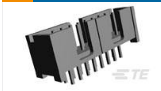
TE Part #103308-2 014 LOPRO HDR SP 15DP