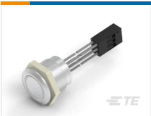
TE Part #2342832-1 AVC16L FLAT AIO RGB R 500MM/2X3