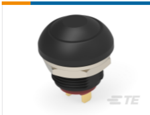
TE Part #2-2329383-1 PB ON/OFF FC BLK M1 TERM IP68