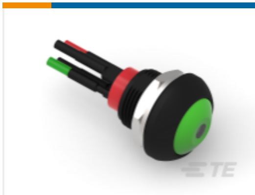
TE Part #1-2329389-9 PB OFF/ON FC GRE M1 TERM GRE LED IP68 50