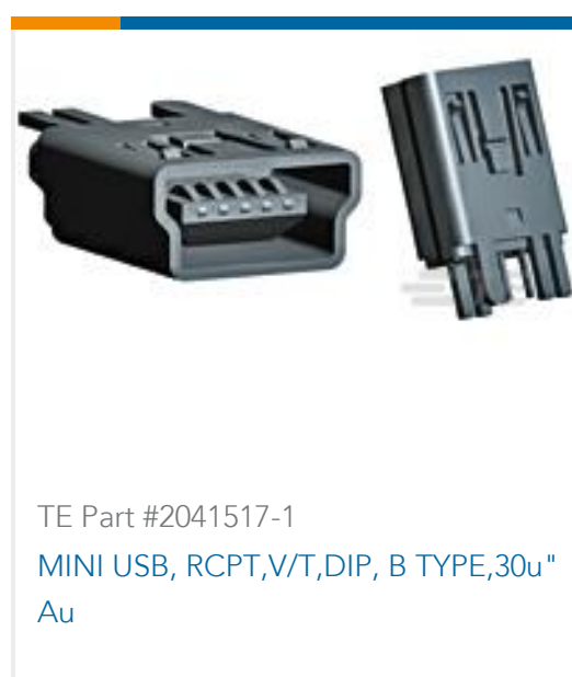
TE Part #2041517-1 MINI USB, RCPT,V/T,DIP, B TYPE,30u" Au