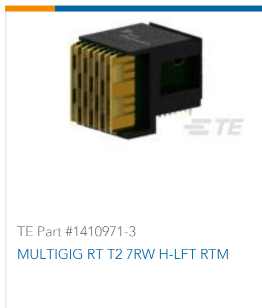
TE Part #1410971-3 MULTIGIG RT T2 7RW H-LFT RTM