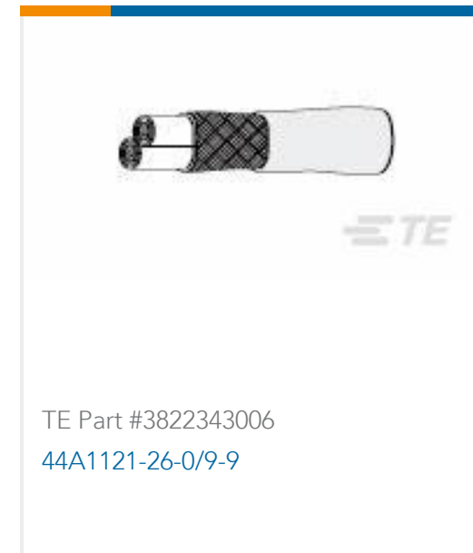
TE Part #3822343006 44A1121-26-0/9-9