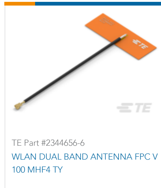
TE Part #2344656-6 WLAN DUAL BAND ANTENNA FPC V 100 MHF4 TY