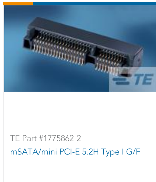
TE Part #1775862-2 mSATA/mini PCI-E 5.2H Type I G/F