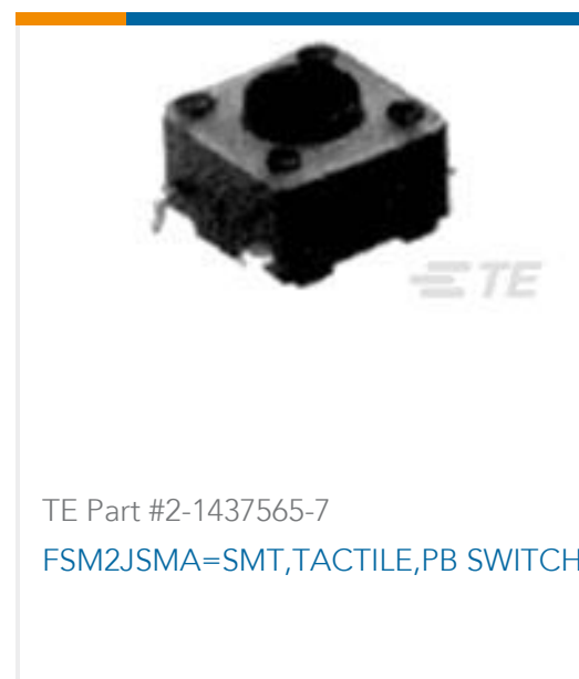
TE Part #2-1437565-7 FSM2JSMA=SMT,TACTILE,PB SWITCH