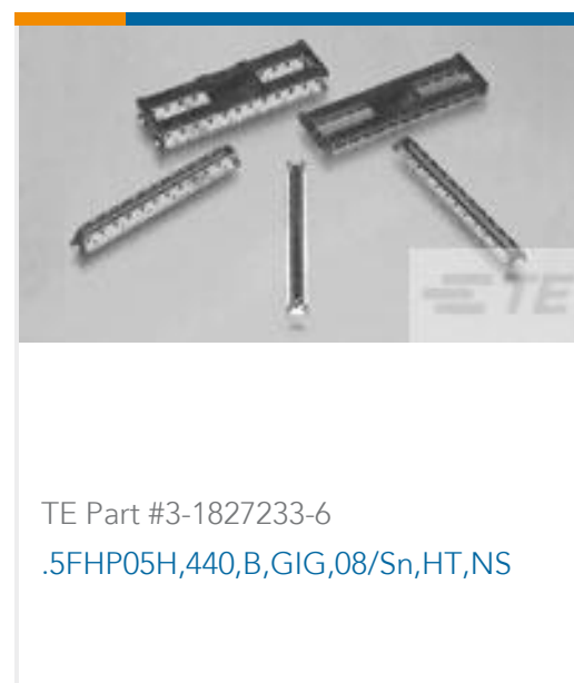
TE Part #3-1827233-6 .5FHP05H,440,B,GIG,08/Sn,HT,NS