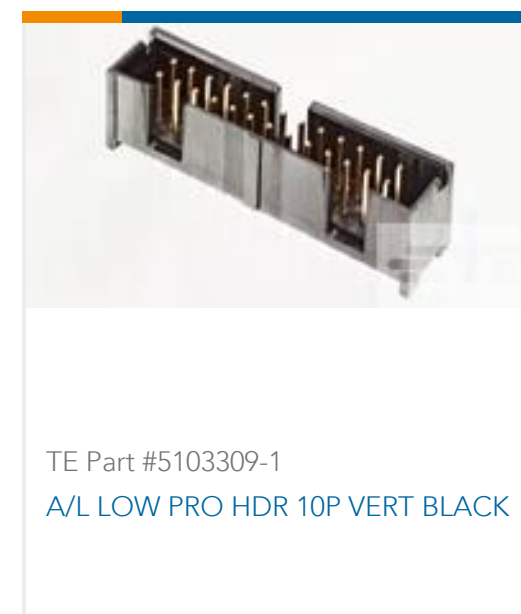
TE Part #5103309-1 A/L LOW PRO HDR 10P VERT BLACK