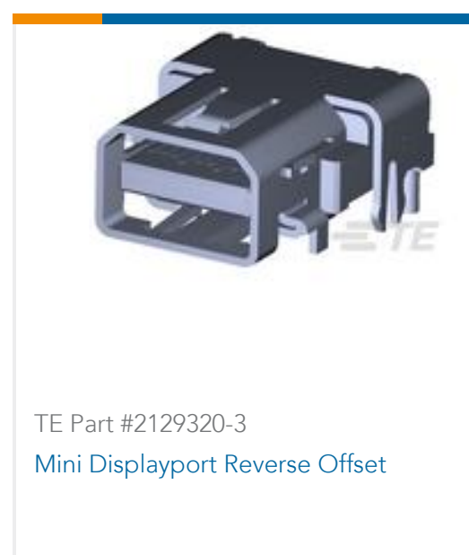
TE Part #2129320-3 Mini Displayport Reverse Offset