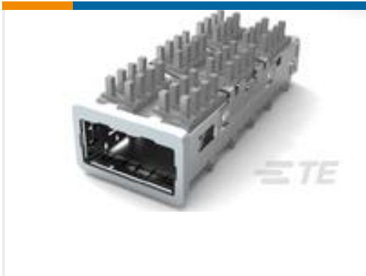
TE Part #1551892-1 Cage Assy Behind Bezel QSFP28