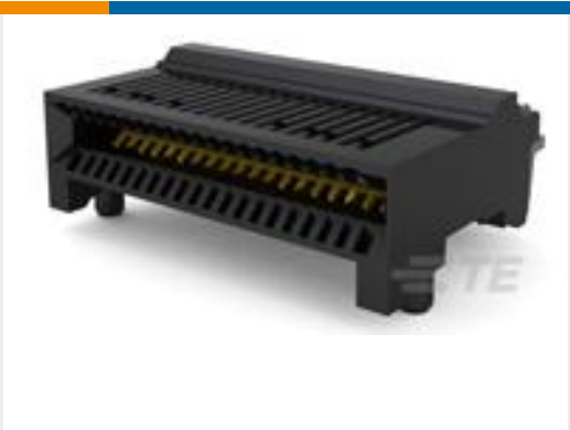
TE Part #1551920-2 zQSFP+ connector assembly