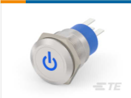
TE Part #3-2213766-7 AV19 SPL 5A POWER LED BLUE 12V