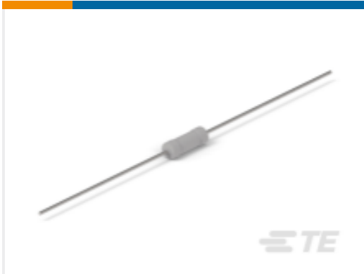
TE Part #3-1676123-6 1/2W SM M/OX 5% 24R