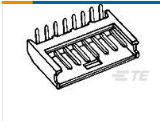
TE Part #280378-1 4P AMPMODU II SHRD HDR, RT ANG, TIN