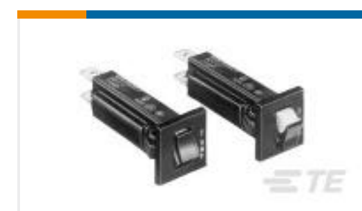
TE Part #1-1393250-7 W28-XQAT-15=W28