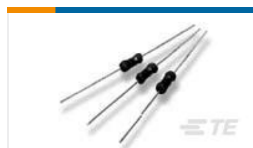
TE Part #4-1879350-2 RR01 5% 11R AMMO