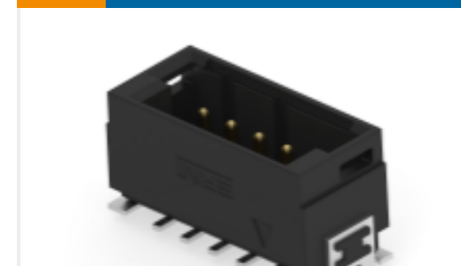
TE Part #474006-E DRCQ 2,54 10 M * SMD * 137 E012 094 GU-H