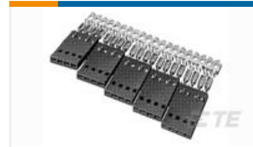
TE Part #103648-7 08 MTE RCPT HSG SR RIB .100CL