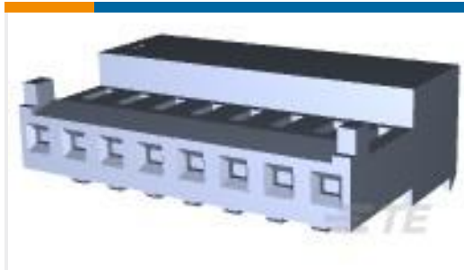
TE Part #3-643816-8 08P MTA100 CONN ASSY POL RIB