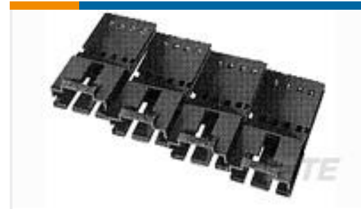
TE Part #103653-7 08 MTE SHRD PIN HSG SR LATCH