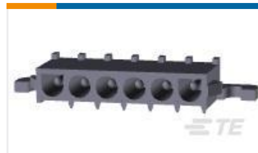
TE Part #643234-1 06P UMNL HDR ASSY R/A 94VO