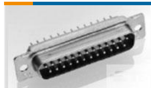
TE Part #1757819-6 AMPLIMITE, ASY, PLUG, STD, 109, ZN, 1, CT