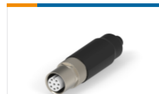
TE Part #1-2823448-3 M12 A-F-8 CRI ST CAT 5 MEGALI 5.3 MM, LEON