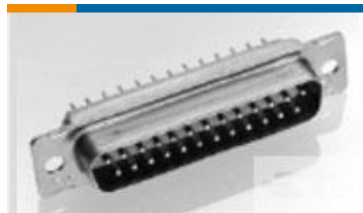
TE Part #205561-2 RECEPT ASSY, 37 POSN, AMPLIMITE