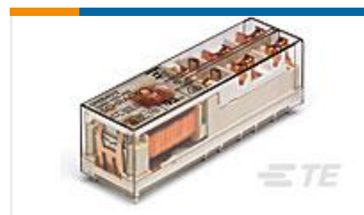
TE Part #6-1415537-5 SR6A6K24