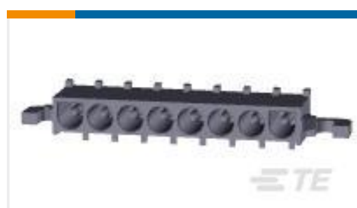
TE Part #643236-1 08P UMNL HDR ASSY R/A 94VO