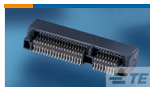
TE Part #1775862-2 mSATA/mini PCI-E 5.2H Type I G/F