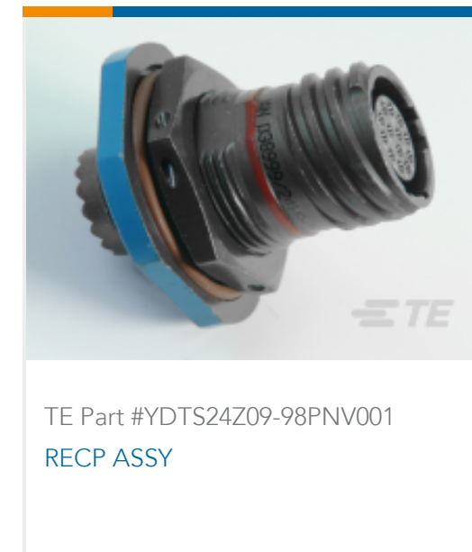
TE Part #YDTS24Z09-98PNV001 RECP ASSY