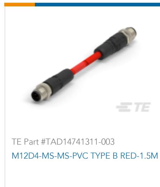
TE Part #TAD14741311-003 M12D4-MS-MS-PVC TYPE B RED-1.5M