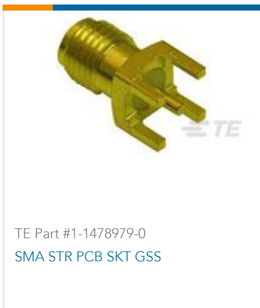
TE Part #1-1478979-0 SMA STR PCB SKT GSS