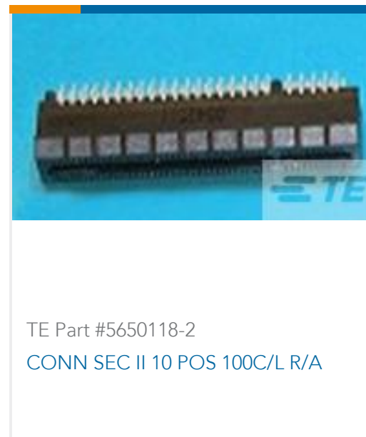
TE Part #5650118-2 CONN SEC II 10 POS 100C/L R/A