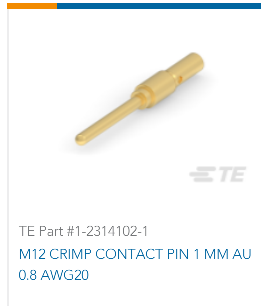
TE Part #1-2314102-1 M12 CRIMP CONTACT PIN 1 MM AU 0.8 AWG20