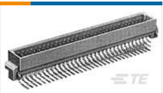
TE Part #650951-5 064 EURO TYPE C PIN ST ASSY