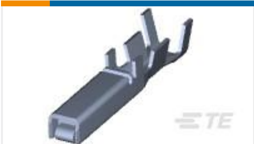
TE Part #175196-3 DYNAMIC D-3 REC CONT/L AU 0.76