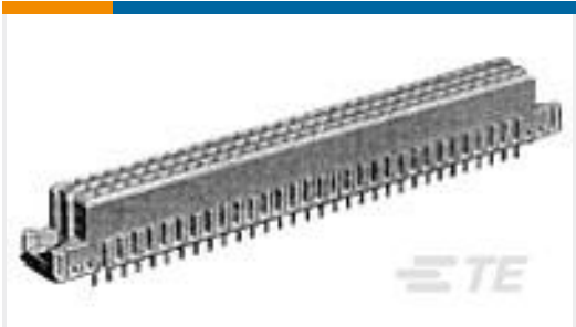
TE Part #5535043-4 ASSY,RECEPTACLE,EUROCARD,TYPE

M12 D-CODED M-4 CABLE GLAND CONECTR MALE