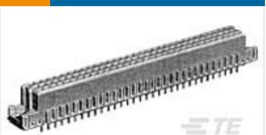
TE Part #650408-5 064 EURO TYPE C RECEPT ST ASSY