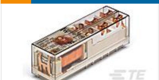
TE Part #6-1415537-5 SR6A6K24