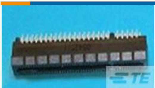
TE Part #5650118-2 CONN SEC II 10 POS 100C/L R/A