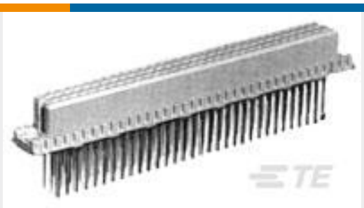
TE Part #1-148167-5 064 EURO TYP C RECP 13MM ASSY