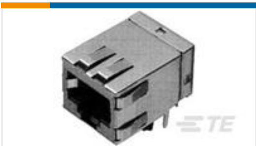
TE Part #1-5406299-1 MJ ASSY,S/P,8POS,SH,RVPGT,CAT5