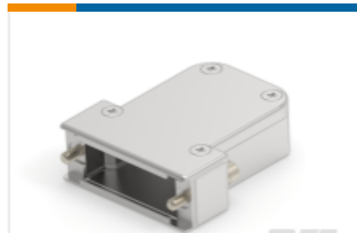
TE Part #1-2308341-1 FULL METAL HOODS SIZE 2