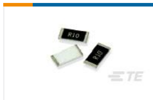
TE Part #2-2176058-7 RLP73K 3A R12 5% 2K RL