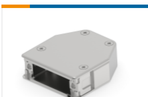
TE Part #1-2308321-1 FULL METAL HOODS SIZE 2, (1)