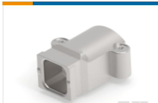
TE Part #1-2308272-4 CABLE CLAMP4 (CASE RAW)