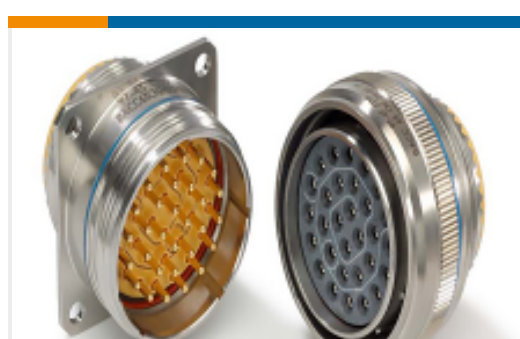
TE Part #ZPF00000000114632 983-6SE 22-39 PN