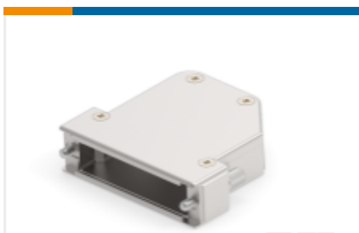
TE Part #1-2308342-3 FULL METAL HOODS SIZE 3-3 (RAW)