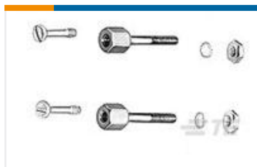
TE Part #5552563-1 HDW KIT, SCR LOCK, VERT MTG