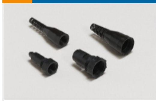
Connector Strain Relief(53)