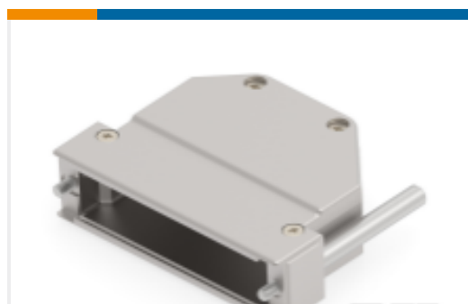
TE Part #1-2308345-5 FULL METAL HOODS SIZE 4 - 5 (RAW)