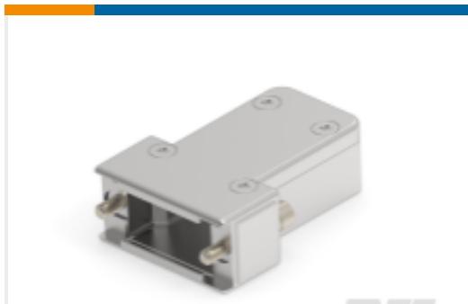
TE Part #1-2308340-1 FULL METAL HOODS SIZE 1