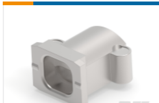
TE Part #1-2308272-5 CABLE CLAMP5 (CASE RAW)