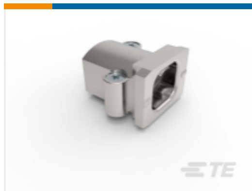
TE Part #1-2308272-1 Cable Clamp for Size 1-3 STD/1-4 QL Shell