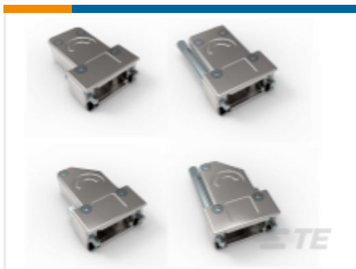
TE Part #1-2308340-1 D-Sub Backshell Size 1