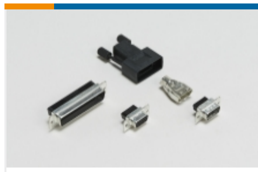
Crimp D-Sub Connectors(10)