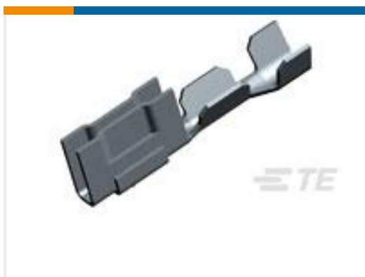
TE Part #1445336-3 LOOSE PC CONTACT 30 AU PLATED