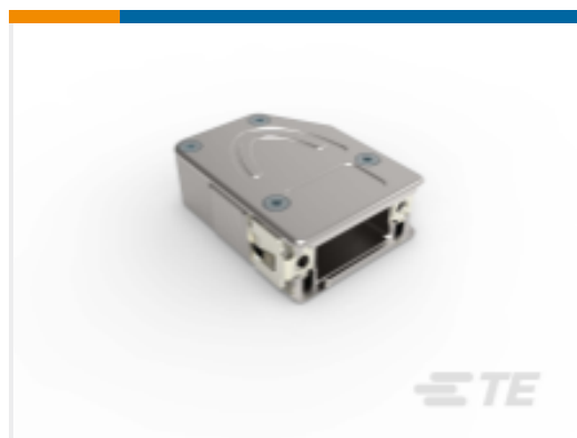
TE Part #1-2308319-1 FULL METAL HOODS SIZE 1 (1)