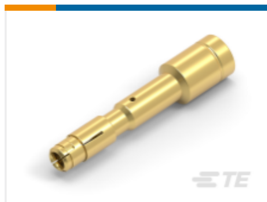
TE Part #60-0302-011-000 CONTACT SOCKET 2 MM