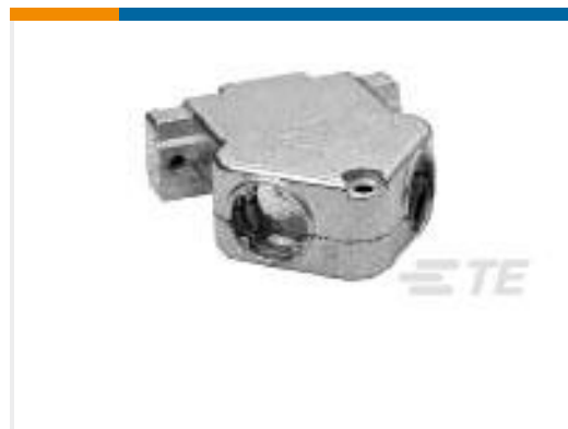
TE Part #1534807-1 HD20 COVER KIT 15P