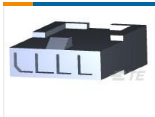
TE Part #1445049-4 FREE HANG SNGL ROW HSG 4 POS