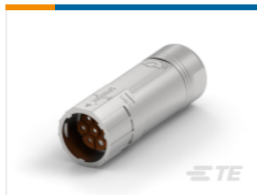
TE Part #BSA078N00420100000 923 PLUG, SPEEDTEC