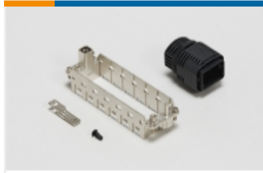
Rectangular Connector Hardware(19)