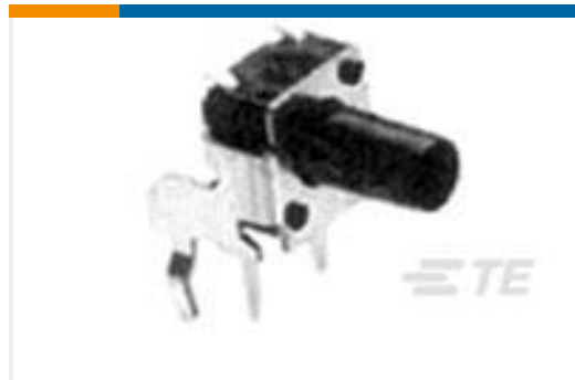
TE Part #1825027-2 FSMRA1JH04=R/A,TACT PB SW,160G