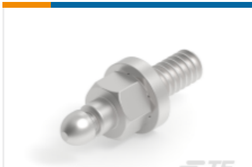
TE Part #1-2308265-5 QL SET FOR VARIANT B 5