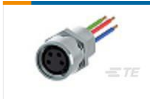
TE Part #1-2120959-1 M8 FEMALE SOCKET WITH WIRES, 0.25 SQMM