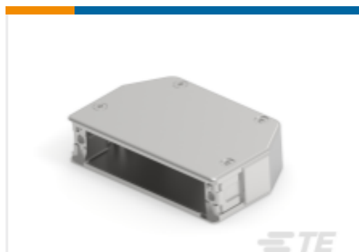
TE Part #1-2308338-1 QL-FULL METAL HOODS SIZE 5 (1 CABLE CLP)