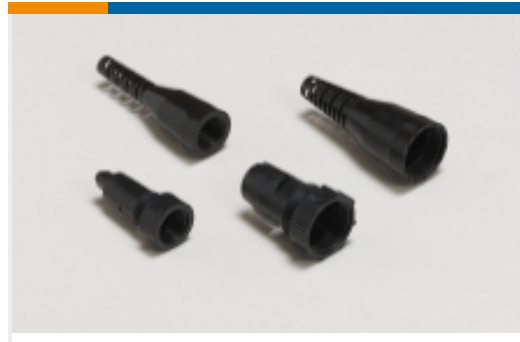
Connector Strain Relief(53)