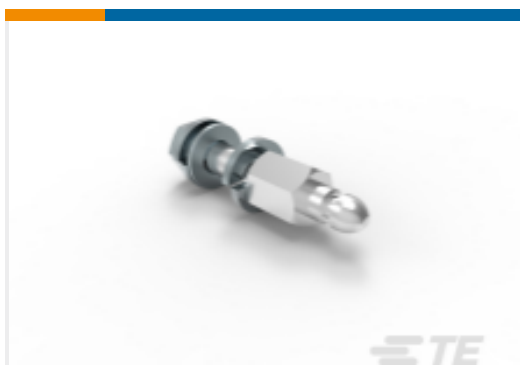
TE Part #1-2308290-1 QL-SET FOR VARIAN C VW REAR WALL MOUNTG