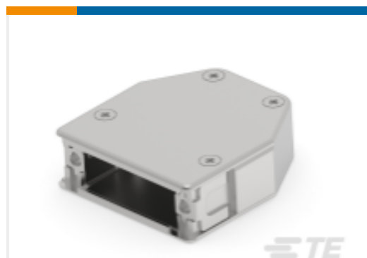
TE Part #1-2308321-1 FULL METAL HOODS SIZE 2, (1)