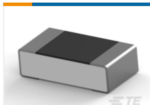
TE Part #5-2176367-5 RQ 0603 16K9 0.1% 10PPM 1K RL