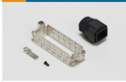
Rectangular Connector Hardware(19)