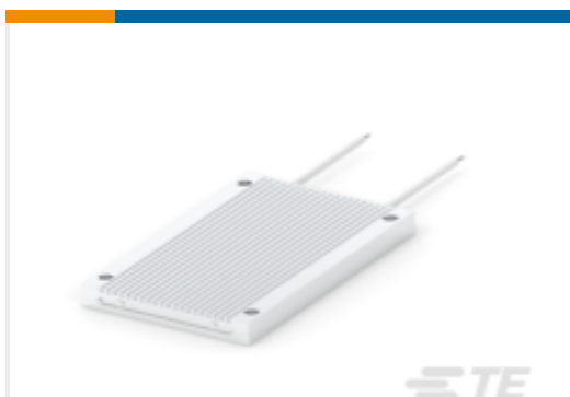
TE Part #2176248-3 TJT 250W 2R2 5%