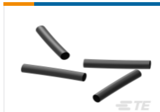
TE Part #063725P074 ES2000-NO.2-B9-0-43MM