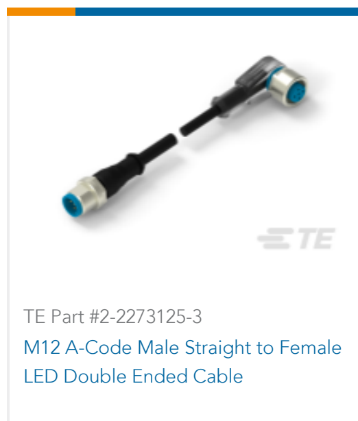
TE Part #2-2273125-3 M12 A-Code Male Straight to Female LED Double Ended Cable