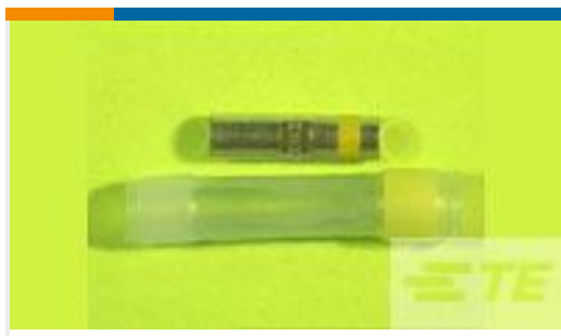
TE Part #650126-000 D-436-82