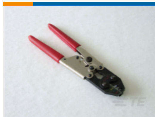
TE Part #992008-000 AD-1377-CRIMP-TOOL-3-CVTY