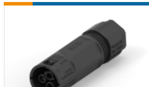
TE Part #1-2379237-1 NECTOR T, INLINE SOCKET, SCREW, Key-A,S2