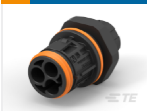
TE Part #2359518-1 NECTOR T, PANEL PIN, SCREW, Key- A