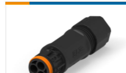
TE Part #1-2379238-1 NECTOR T, INLINE PIN, SCREW, Key- A, S2