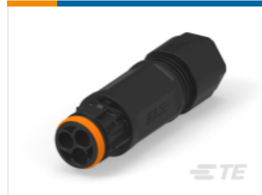
TE Part #2379238-1 NECTOR T, INLINE PIN, SCREW, Key- A, S1