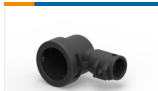
TE Part #185793-1 90 DEG CAP CORRUGTD TUBE