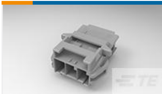
TE Part #5-1971772-3 PTL 1X3 CAP PANEL MT HITEMP KEY A LGR