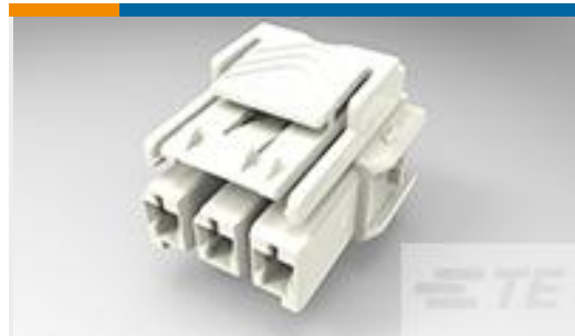
TE Part #1-1971773-3 PTL 1X3 PLUG HSG STD TEMP KEY A NAT