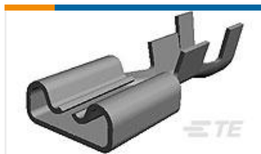
TE Part #1742198-1 250 FASTON, REC., 18-14 AWG, NPST