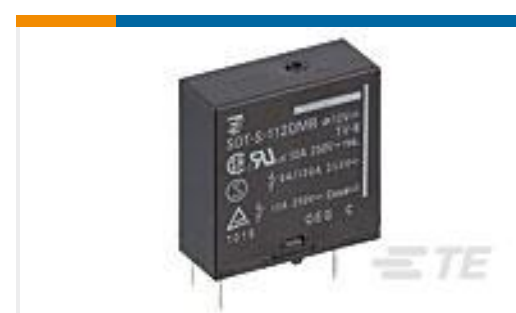
TE Part #8-1419125-5 SDT-S-106LMR,000