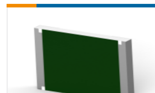
TE Part #8-2176407-8 3560 27R 5%