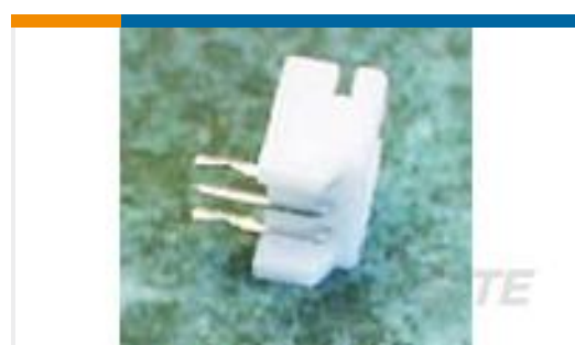
TE Part #1-440055-1 2.0MM,HDR,11POS,R/A