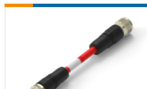
TE Part #TAA545B1411-060 M12A4-MS-FS-PVC-6.0M