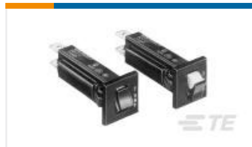
TE Part #1-1393250-7 W28-XQAT-15=W28