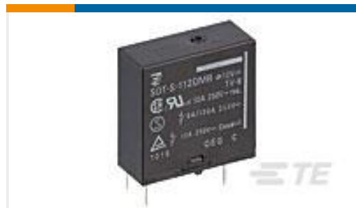
TE Part #8-1419125-5 SDT-S-106LMR,000