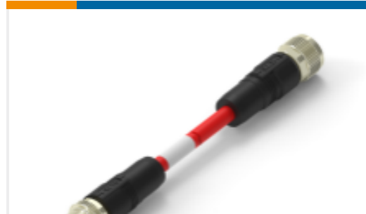
TE Part #TAA545B1411-060 M12A4-MS-FS-PVC-6.0M