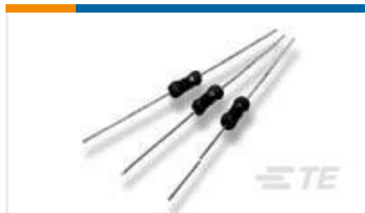
TE Part #4-1879350-2 RR01 5% 11R AMMO