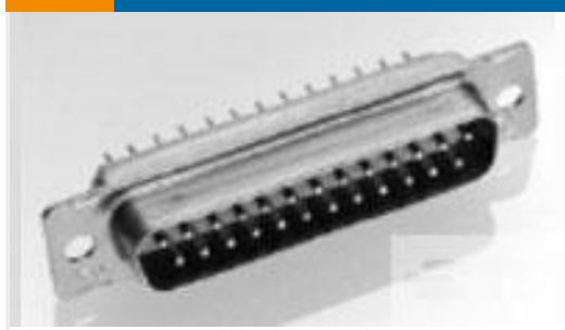
TE Part #1757819-2 AMPLIMITE,ASY,PLUG,STD,109,ZN,2