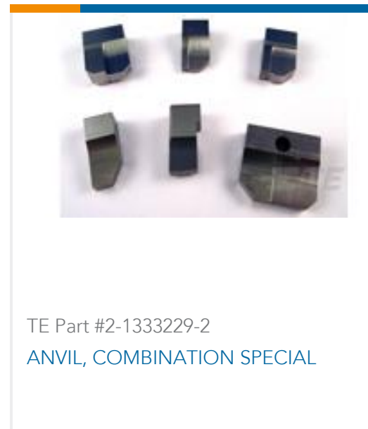
TE Part #2-1333229-2 ANVIL, COMBINATION SPECIAL