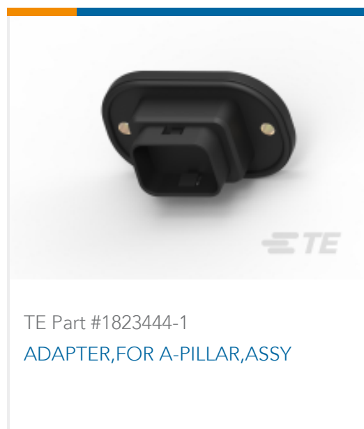
TE Part #1823444-1 ADAPTER, FOR A-PILLAR, ASSY