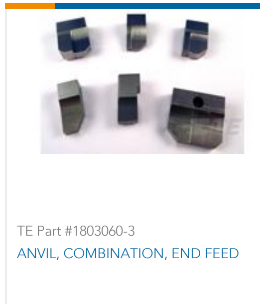
TE Part #1803060-3 ANVIL, COMBINATION, END FEED