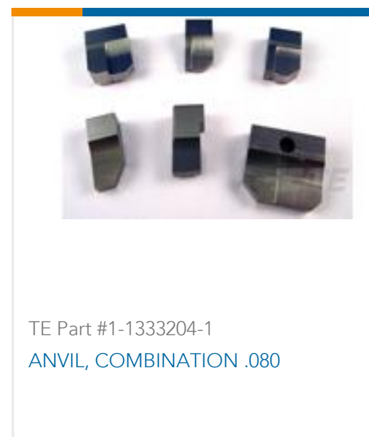
TE Part #1-1333204-1 ANVIL, COMBINATION .080