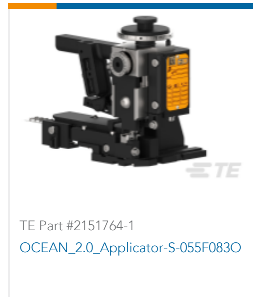
TE Part #2151764-1 OCEAN_2.0_Applicator-S-055F083O