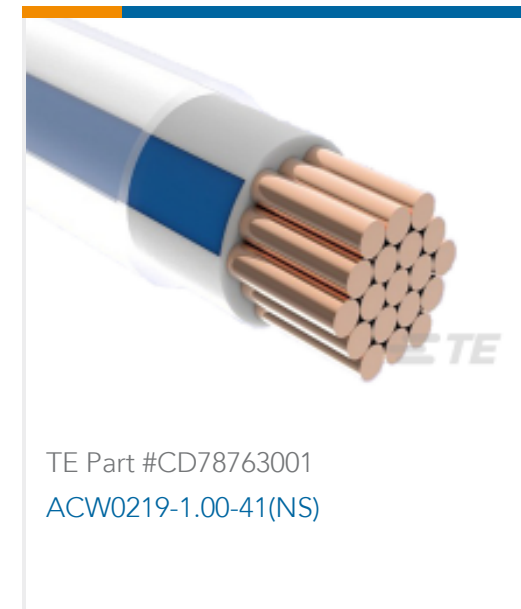
TE Part #CD78763001 ACW0219-1.00-41(NS)