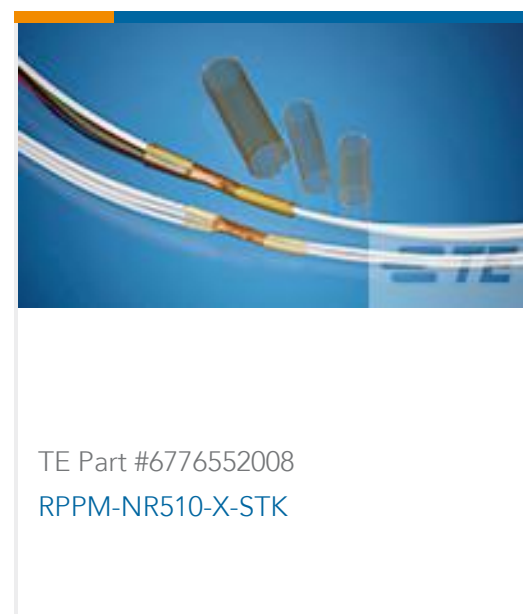
TE Part #6776552008 RPPM-NR510-X-STK