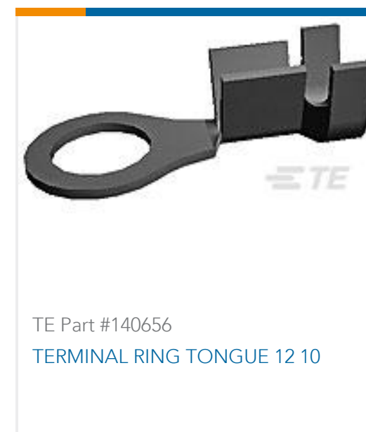
TE Part #140656 TERMINAL RING TONGUE 12 10