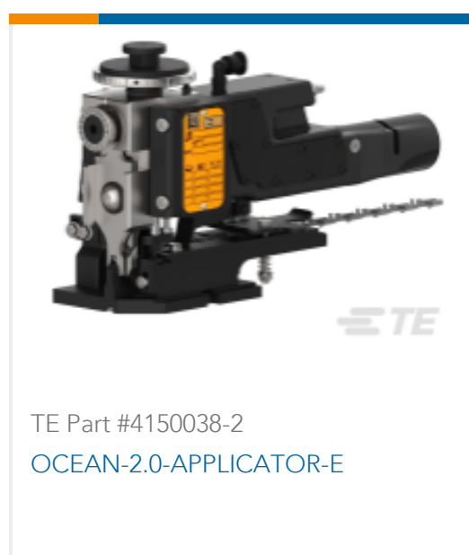
TE Part #4150038-2 OCEAN-2.0-APPLICATOR-E