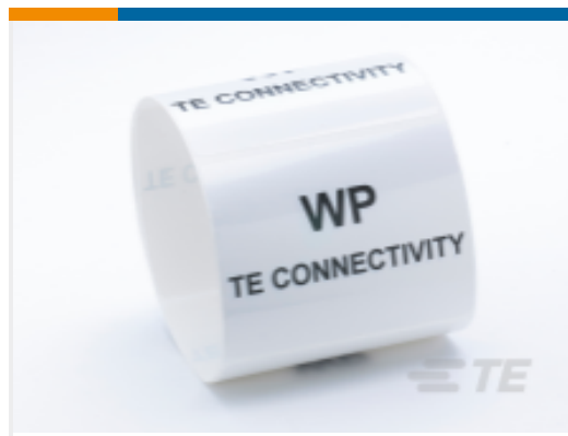
TE Part # CAT-T3437-W919 WP White Polyester Labels