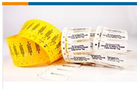
TE Part #E17344-000 CM-SCE-TP-1/2-4H-9