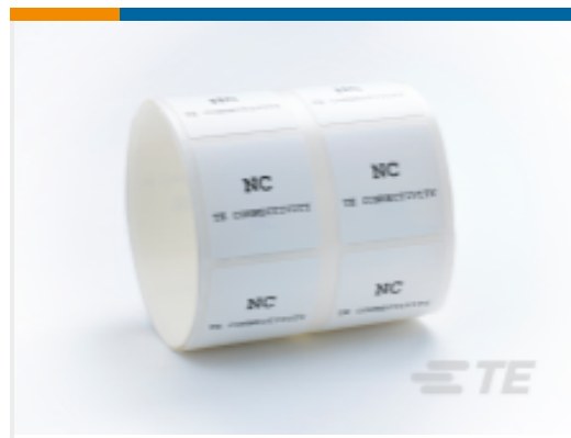
TE Part # CAT-T3437-N2393 NC Nylon Cloth Labels