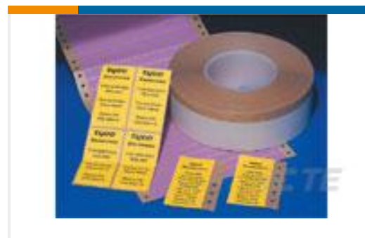
TE Part #335276-000 TTVF150WE-100