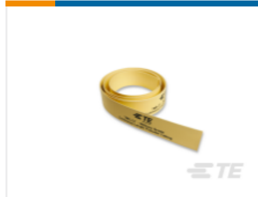
TE Part # CAT-C7679-T548 Continuous Tube, Military Grade TMS-CT