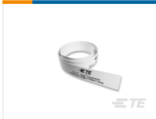
TE Part # CAT-C7679-H85999 Continuous Tube High Temperature HT-CT