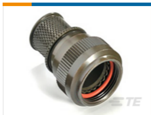
TE Part #BTH1-11-06-1-C BTH1-11-06-1-C