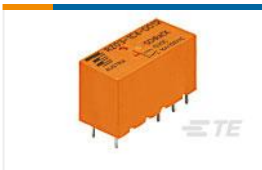
TE Part #1-1415899-3 RZ03-1A4-D005