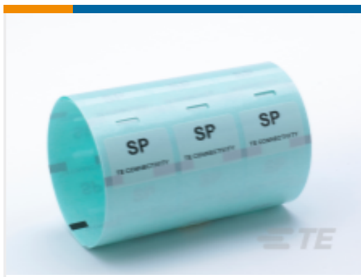
TE Part # CAT-T3437-SP1 SP Self Laminating Polyester Labels