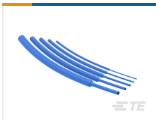
TE Part #NB19414001 RNF-100-3/16-BU-SP