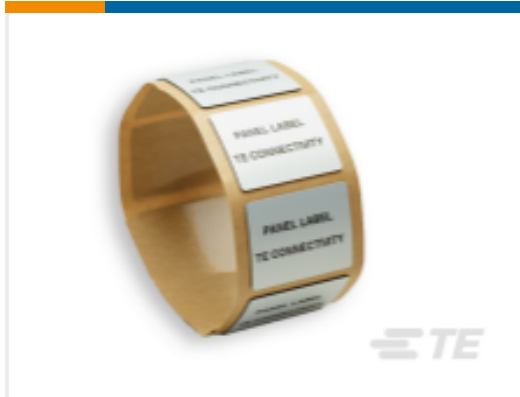
TE Part # CAT-L1126-P689 Thermal Transfer Printable Panel Labels