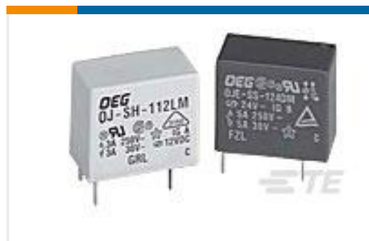
TE Part #1461400-1 OJE-SH-105DM,000