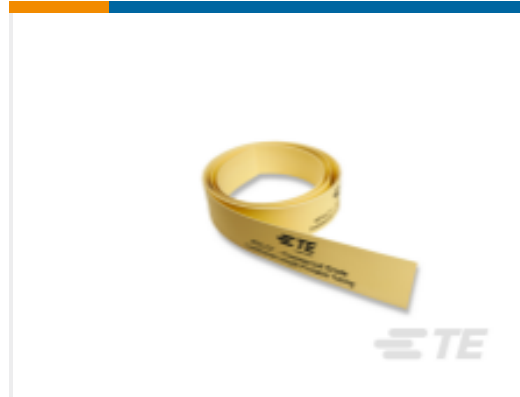
TE Part # CAT-C7679-R819 Continuous Tube Commercial Grade RPS-CT