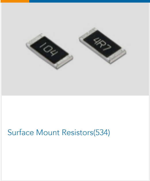
Surface Mount Resistors(534)