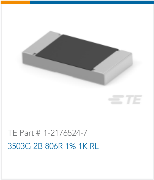
TE Part # 1-2176524-7 3503G 2B 806R 1% 1K RL