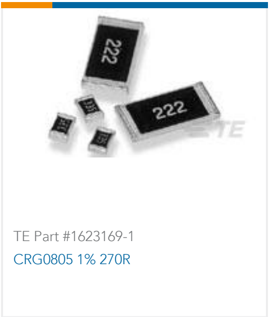
TE Part #1623169-1 CRG0805 1% 270R