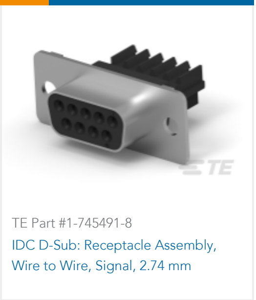
TE Part #1-745491-8 IDC D-Sub: Receptacle Assembly, Wire to Wire, Signal, 2.74 mm