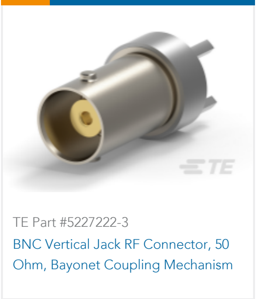
TE Part #5227222-3 BNC Vertical Jack RF Connector, 50 Ohm, Bayonet Coupling Mechanism