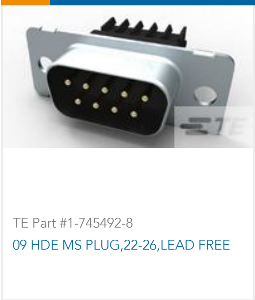
TE Part #1-745492-8 09 HDE MS PLUG,22-26,LEAD FREE