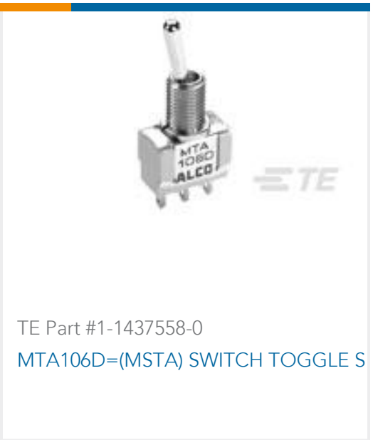
TE Part #1-1437558-0 MTA106D=(MSTA) SWITCH TOGGLE S