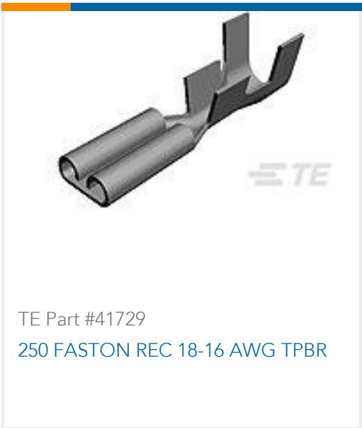
TE Part #41729 250 FASTON REC 18-16 AWG TPBR